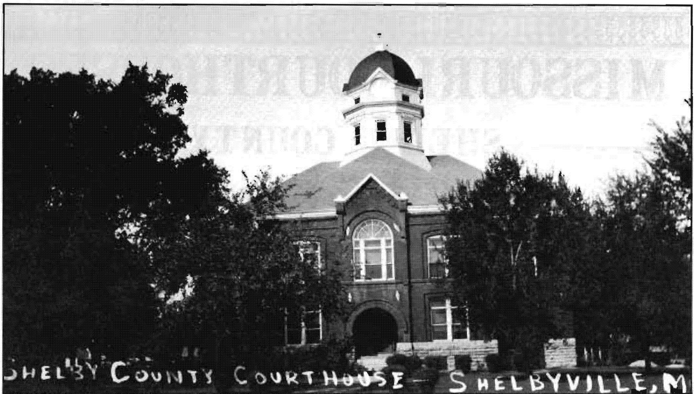
Fig. 2. Shelby County Courthouse, 1891-. Architect: Jerome B. Legg.

dissatisfaction came from those who wanted more ornament on the building.