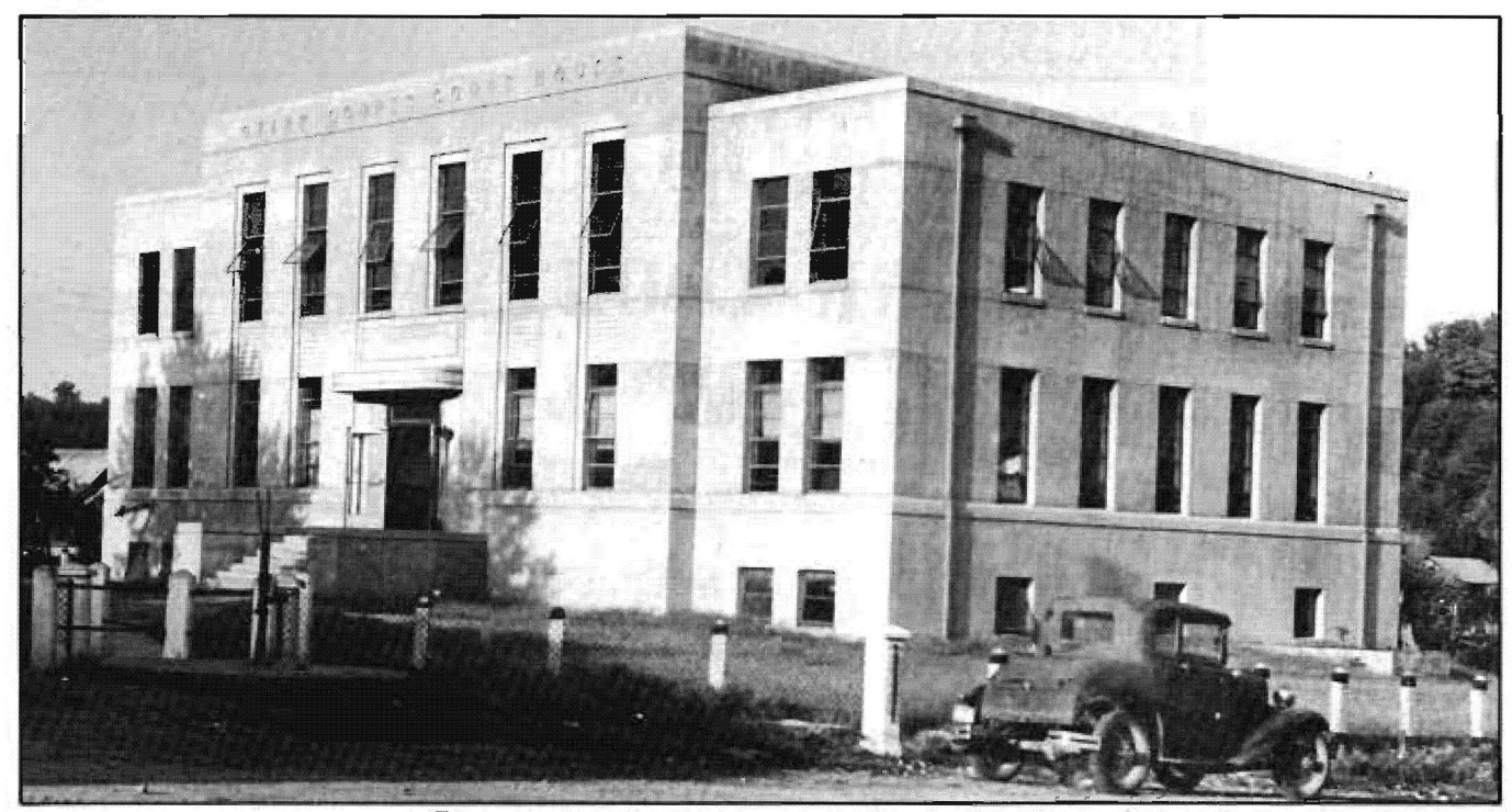
Fig. 2. Ozark County Courthouse, 1939-. Architect: Earl Hawkins