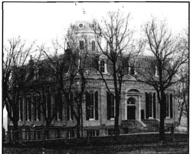
Fig. 2. Osage County Courthouse, after 1881 remodeling. Architects: Goesse & Rimmers (From: Osage County Centennial , 1941)