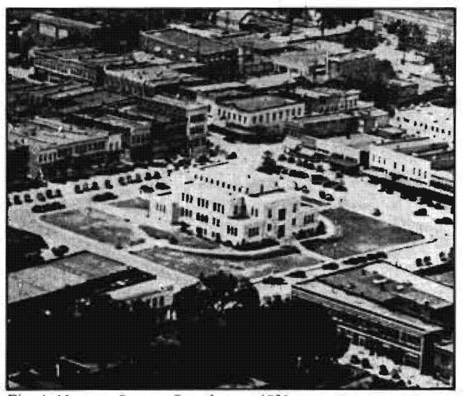
Fig. 4. Newton County Courthouse, 1936-.

Built of Carthage stone, the building consisted of four stories: basement, first floor for general offices, second floor for the Circuit Court room, and top floor for the jail (Figs. 3 and 4). The building measured about