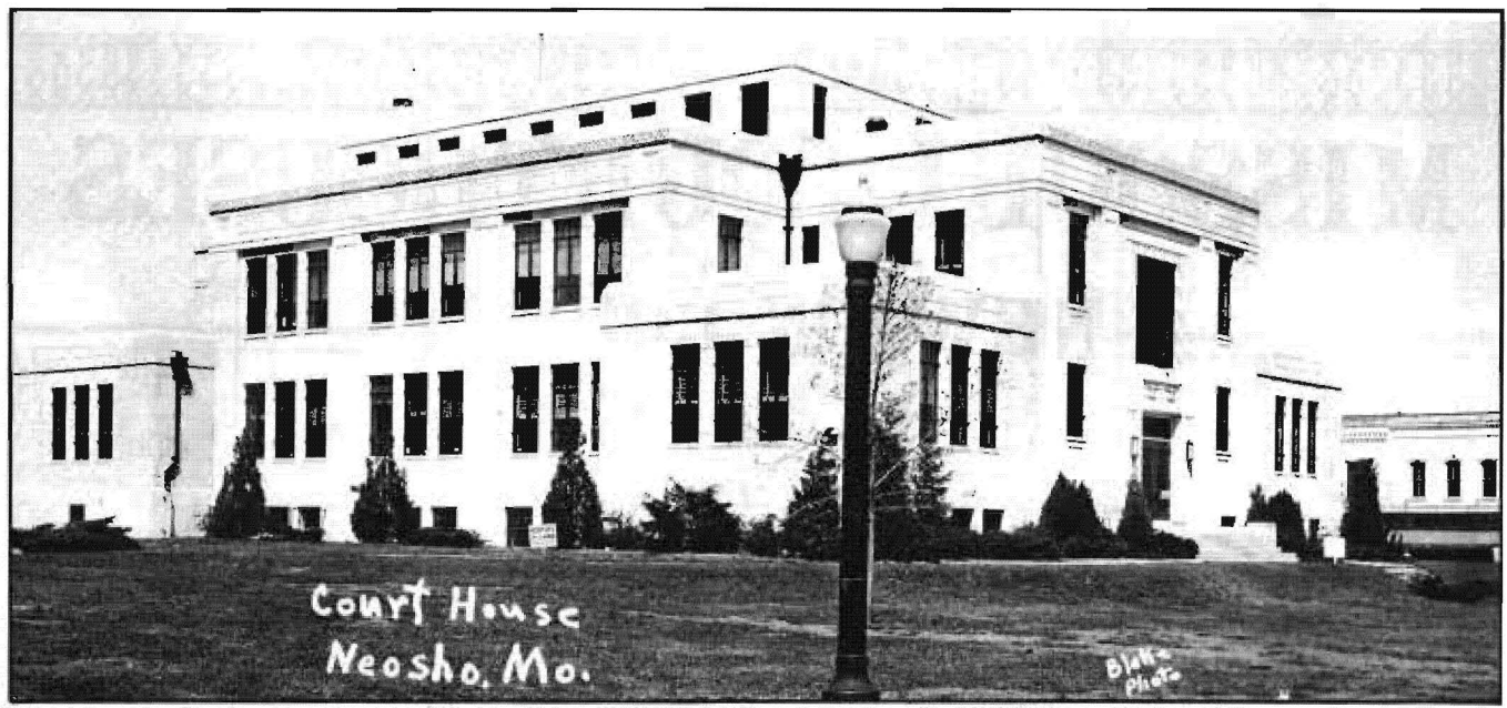
Fig. 3. Newton County Courthouse, 1936-. Architect: Neal Davis

(Fig. 2), but the building continued in use until it was razed in December 1935 as construction began on the present courthouse.