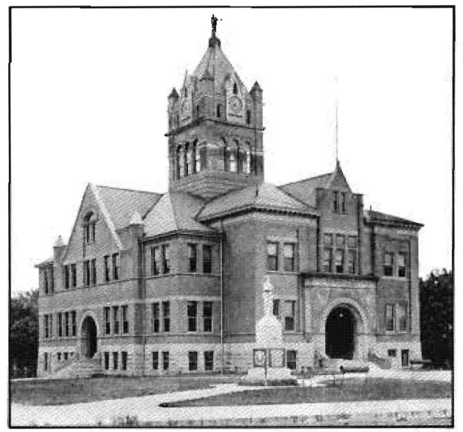
Fig. 2. Marion County Courthouse, Palmyra, 1900-Architect: William N. Bowman