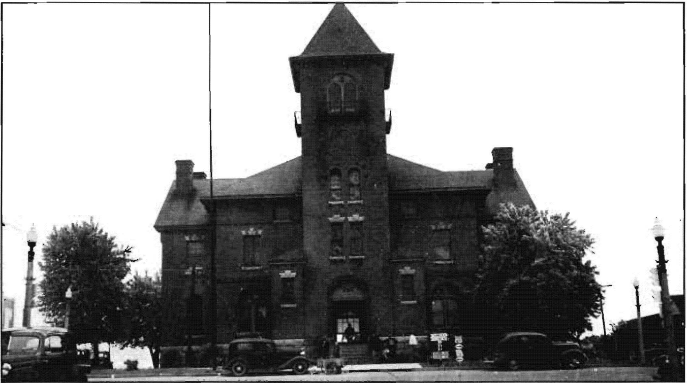
Fig. 2. Madison County Courthouse. 1899-. Architect: Theodore C. Link

originally had a cupola, which was removed in February 1838.