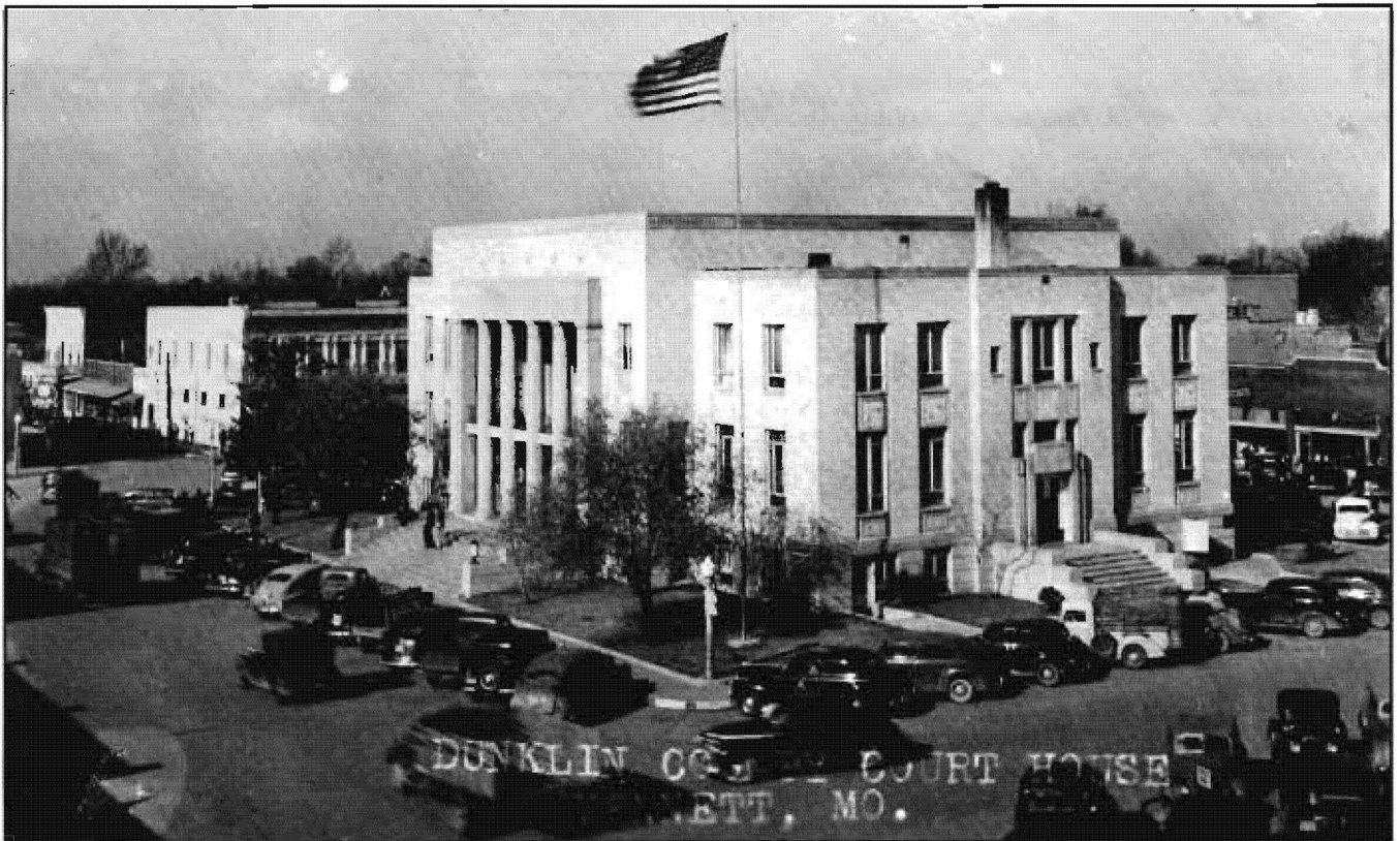
Fig. 2. Dunklin County Courthouse, 1937-. Architect: Ernest T. Friton

Architect Friton also designed Montgomery County's courthouse in 1953. Both buildings are still used for county business.