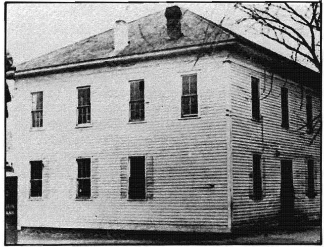
Fig. 1. Carter County Courthouse, 1871-, extensively remodeled in 1936.