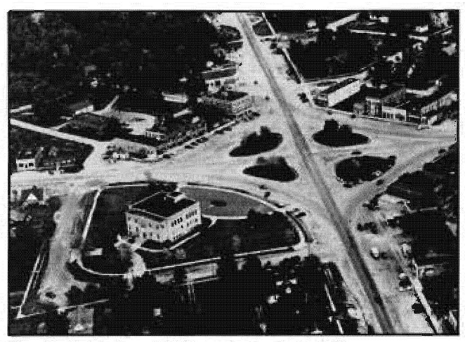
Fig. 2. Aerial view of 1931 courthouse (lower left).

which cost about $4,000, was built by W. J. Cochran and Sons of Boonville.