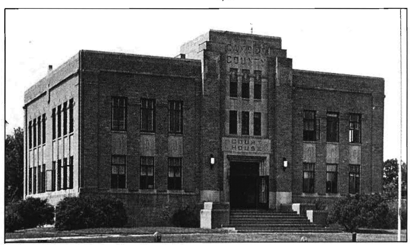
Fig. 3. Camden County Courthouse, 1931-. Architect: Victor DeFoe

The building was completed in July 1932. The yellow brick and tile building measures 76 by 76 by 32 feet and is trimmed with stone. A public assembly hall was planned for the half basement. County offices are on the first floor and the courtroom on the second floor. It was the first Missouri courthouse built in a modern style.