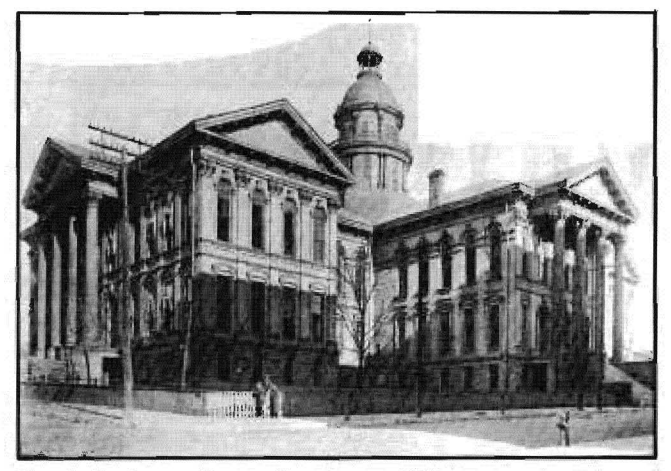
Fig. 2. Buchanan County Courthouse, 1873-. Architect: P. F. Meagher

County government grew rapidly from the 1840s until 1870, and even before the architects examined the deteriorating courthouse, citizens called for a new and larger one. John C. Cochrane from Chicago, Illinois, who designed the Saline County courthouse in 1881, submitted a proposal for the court's consideration, but the court accepted the preferred design of P. F. Meagher on March 28, 1873. A complete description of Meagher's plans was published in the St. Joseph Weekly Gazette, April 2, 1873.