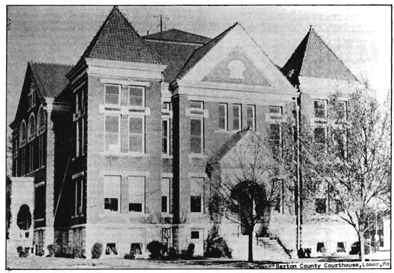
Fig. 2. Barton County Courthouse, 1888-, after roof alteration.

permanent building. At that time it was sold, moved and diverted to other uses.