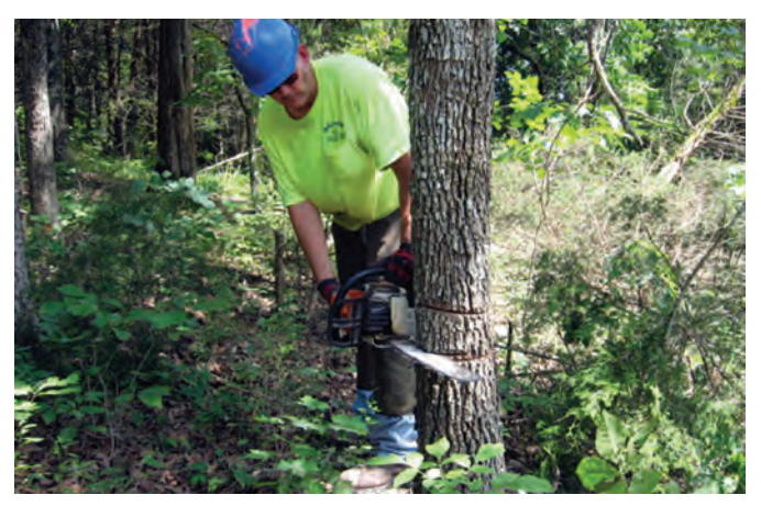
Figure 12. To thin trees near the edge of a woodland tract, cut or girdle them and treat them with a herbicide.

abrupt change from forest to field (Figure 10a). Edges can be improved by encouraging a gradual transition of plant types between the forest and field with a technique called edge feathering (Figure 10b) or by establishing a field border. Thinning or cutting trees near the edge of a woodland tract or adjacent to logging roads or right of ways can also create transition zones between habitat types (Figure 11). Trees more than 15 feet tall that are within 15 feet of the adjacent field can be cut or girdled (Figure 12). Treat all cut stumps, except eastern red cedar, with an approved herbicide to