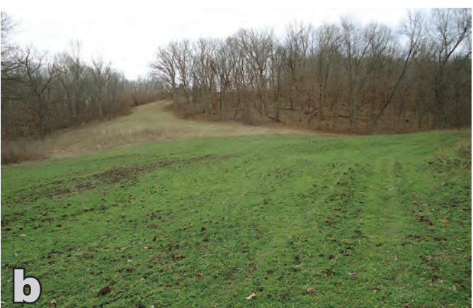
Figure 9. Permanent openings can be created within a forest stand to provide habitat diversity. These areas can be planted to a cool- or warm-season food plot to provide supplemental forage for deer.

Temporary forest openings, often called group openings , are essentially small clearcuts created in a forest to provide early successional forest habitat for wildlife. Temporary openings promote the growth of sprouts, shrubs, grasses and herbaceous vegetation (Figure 8). These areas also encourage the regeneration and growth of shade-intolerant species, such as valuable red and white oaks. Forest openings can be created by cutting and dropping all trees and brush in select areas of 3 to 5 acres each within larger contiguous blocks of forest. To be most beneficial, openings should be irregular-shaped to provide increased edge habitat and should be scattered throughout the property.