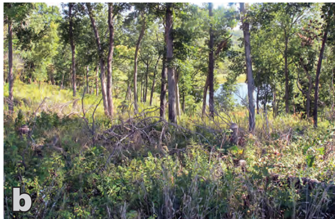
Figure 13. Conducting a prescribed fire (a) is an efficient and economical way to promote early successional habitat within a forest stand (b).

prolong the benefits of edge feathering. Always read and follow chemical labels for proper rates, usage and disposal. Each of these edge feathering techniques can be used to promote the growth of soft mast-producing trees, shrubs and vines that deer use for food and cover.