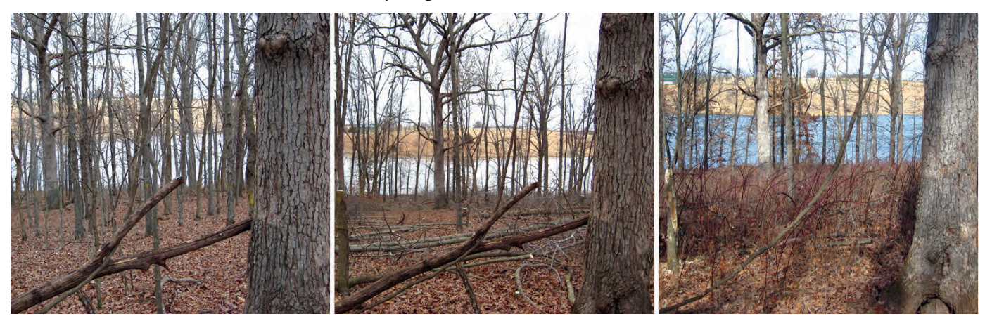
Figure 7. As illustrated in this series of photos of a timber stand (left to right) before being thinned and the first and third years after thinning, timber stand improvement practices open the forest canopy and allow more sunlight to reach the forest floor, stimulating the growth of plants that provide forage for deer.

In a group selection system, small groups of trees are harvested, creating small openings, which are essentially small clearcuts, within the stand. Harvesting small groups of trees allows more sunlight to reach the forest floor, encouraging the growth of early successional vegetation and resulting in an increased abundance of sprouts, shrubs, grasses and herbaceous vegetation, all of which benefit white-tailed deer (Figure 6). Group selection is well suited for small woodlots where occasional harvests are