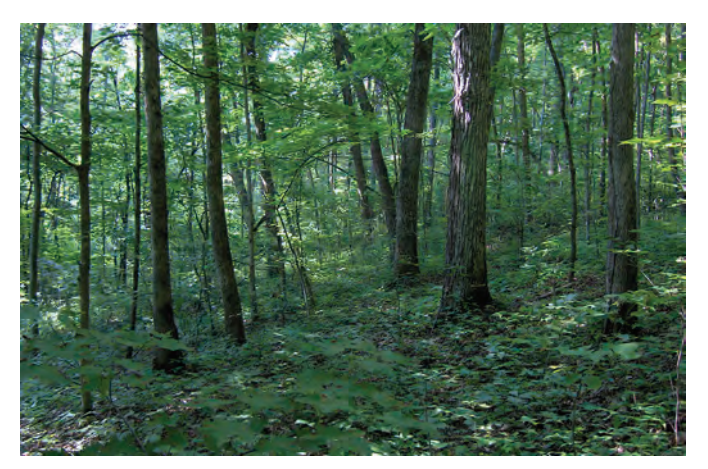
Figure 3. Forests are denser than woodlands and consist of multiple layers of trees in the canopy, with saplings and shrubs in the midstory.