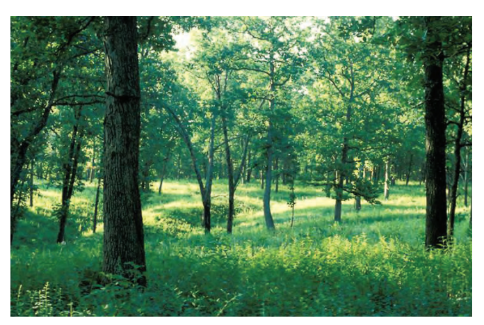
Figure 2. The increased sunlight reaching the ground in open woodlands stimulates the growth of vegetation that provides ample forage and cover for deer.

Fortunately, forestry and wildlife management are not mutually exclusive, and practices that are conducted for timber production can also benefit a variety of wildlife species. This publication describes woodland and forest management practices that can benefit white-tailed deer in particular.