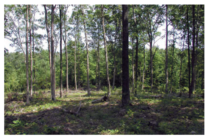
Figure 5. Crop trees are left during shelterwood and seed-tree cuts to promote the regeneration of the harvested area.

The shelterwood technique leaves more crop trees standing after a harvest, and the new stand is established in partial shade. Generally, about 30 to 60 percent of the existing trees are removed during the first shelterwood cut. Then after the new stand is established, the remaining trees are harvested.