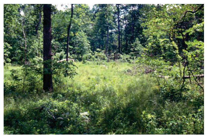
Figure 8. Temporary openings in a forest stand promote not only habitat diversity but also oak regeneration, which leads to greater acorn production.

recommended. This system produces excellent habitat for white-tailed deer by promoting openings with abundant forage and browse and maintaining quality mast-producing oaks within the stand.