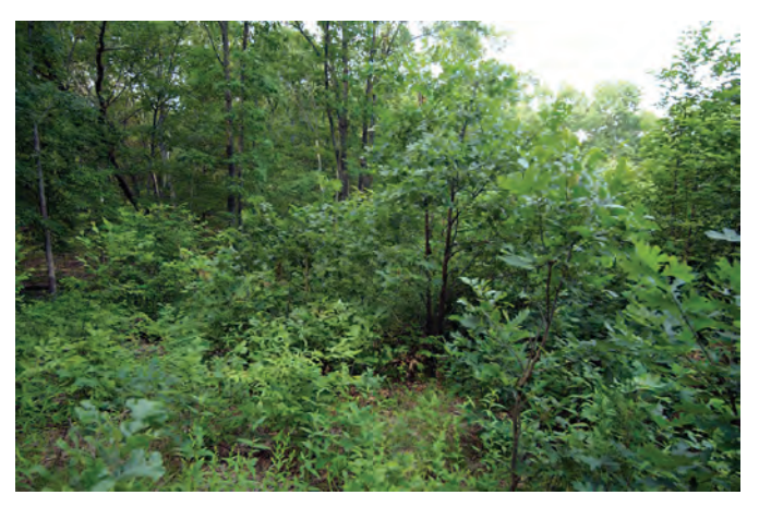
Figure 6. A group-selection timber harvest encourages the growth of an abundance of early successional vegetation, including shrubs and sprouts.

The single-tree selection system creates and maintains an uneven-aged stand. Each tree in the stand is evaluated independently, and individual trees are harvested as they mature. This method can also be used to recruit young oak