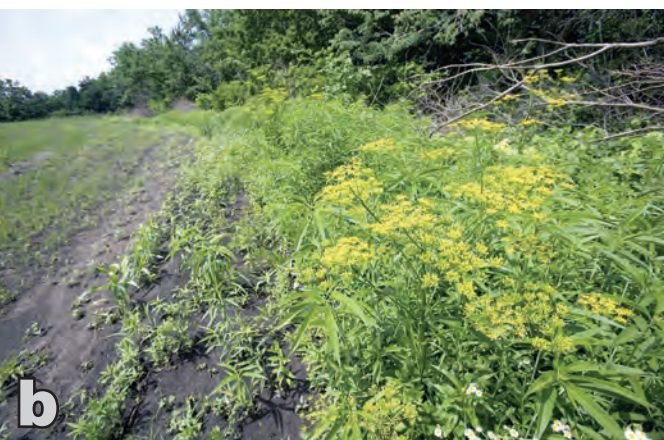
Figure 10. Many wildlife species benefit from edge habitats, but not all edges are created equal. An abrupt edge (a) provides little wildlife value, whereas a feathered edge (b) provides greater diversity and important vegetation that enhances the food and cover value for many wildlife species, including deer.