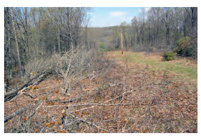
Figure 11. Edge feathering practices can be conducted within forests and woodlands to create transition zones of habitats that are beneficial for deer.

abrupt change from forest to field (Figure 10a). Edges can be improved by encouraging a gradual transition of plant types between the forest and field with a technique called edge feathering (Figure 10b) or by establishing a field border. Thinning or cutting trees near the edge of a woodland tract or adjacent to logging roads or right of ways can also create transition zones between habitat types (Figure 11). Trees more than 15 feet tall that are within 15 feet of the adjacent field can be cut or girdled (Figure 12). Treat all cut stumps, except eastern red cedar, with an approved herbicide to