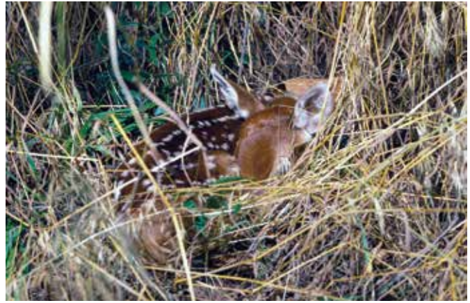
Figure 4. During the first weeks of life, fawns conceal themselves to avoid predators and often use early successional areas for cover.

Scattered shrubs and small trees can make fields of native warm-season grasses and associated forbs more attractive to deer (Figure 6). Shrubs and small trees such as blackberry, sumac, sassafras, dogwoods, elderberry, wild