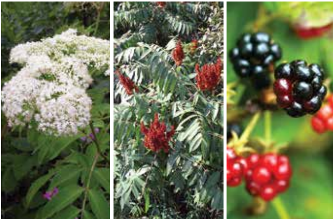
Figure 7. Elderberry, sumac and blackberry are a few of the shrubs that are commonly found in early successional habitats.