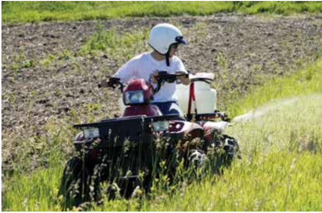
Figure 13. Herbicide applications and spot-spraying to control undesirable plants, such as tall fescue and sericia lespedeza, may be necessary to maintain the quality of early successional habitats.

communities, fields should be disked on a one- to three-year rotation.