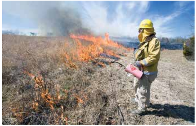
Figure 8a. The use of controlled fire is one of the best ways to maintain early successional areas.