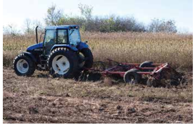
Figure 11. Disking promotes the growth of important forbs, legumes and annual grasses that deer use throughout the year.

A recommended practice is to spread burning activities across a property or management area during any year, making sure that newly burned areas are left adjacent to areas that have not been burned for one, two or three years. This practice provides a diversity of early successional habitats and a variety of food sources and protective cover that deer will use (Figure 9).