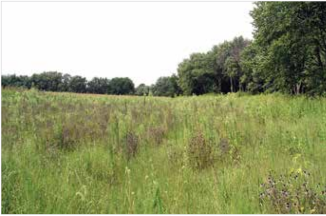
Figure 3. Early successional areas offer a diversity of plants types, including broad-leaved plants, which are important for deer forage.

Disturbances create open, bare ground that allows maximum sunlight to reach the soil, stimulating the plants within the seed bank to germinate and dominate the site.