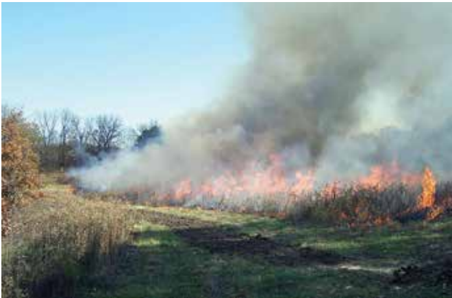
Figure 10. Establish fire lanes around areas to be burned. Fire lanes can be left fallow or planted to a food plot mixture of early successional plants.

density of grasses and increase the germination of forbs and legumes. In addition, burning during the growing season on a one- to two-year return interval will virtually eliminate woody cover from the area and favor a plant community dominated by herbaceous species. For example, if undesirable woody species — such as green ash, honey locust or red maple — begin to encroach into a field, burn the area in late summer or early fall. A burn at this time will kill the trees by preventing the flow of carbohydrates down to the root system for winter storage. Dormant and spring fire will often top-kill deciduous, woody sprouts but are not as effective in control as late-summer, early-fall burns.