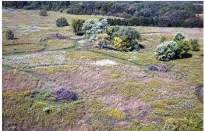
Figure 1. Early successional vegetation benefits many wildlife species in addition to white-tailed deer, especially when interspersed with shrubby cover, woodlands and forested habitats.

With Missouri’s temperate climate and rainfall, early successional habitats will not remain static but will change over time in a process called ecological succession . Ecological succession, or plant succession, is the orderly process of one plant community transitioning or “advancing” to another over time. Starting from bare ground, annual plants are the first to establish, followed by perennials, which eventually shade-out many of the annuals. As plant succession progresses, woody perennial plants, such as vines and shrubs, become established. Next, larger trees that are more shade tolerant will become established, and if not disturbed, the plant community will gradually advance to form a woodland and eventually a closed-canopy forest. Figure 2 depicts a typical sequence of change from one plant community to another.