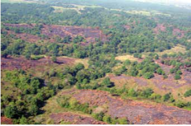
Figure 9. Applying fire in a mosaic pattern allows for a diversity of cover and food sources for a variety of wildlife including deer.