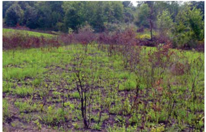
Figure 8b. Vegetation quickly regrows after a burn.

Knowing which management practices can achieve the desired results — and their proper timing and application — is important when determining which practices to implement (Table 1).