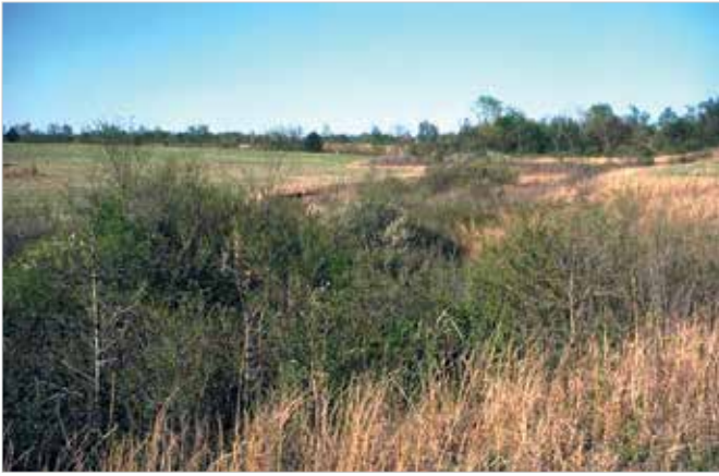
Figure 6. Shrubs in old field habitats provide deer with important browse plants as well as concealment cover.