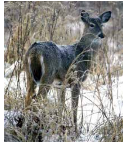
Figure 5. Native grasses that are 3 to 6 feet tall can provide ideal cover for deer in winter.

plums, persimmon, hazelnut, witchhazel, hawthorn, American crabapple and wild cherry provide cover and important food for deer throughout the year (Figure 7). These shrubs can be important for wildlife, but they are often mowed before they can provide any benefits.