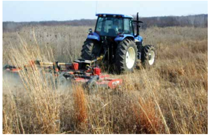
Figure 14. Mowing can prepare a field for early successional management, but it is rarely a good stand-alone habitat management practice.

Different plants require different herbicides and application techniques to be effectively controlled, so be sure to check the label to ensure you have selected