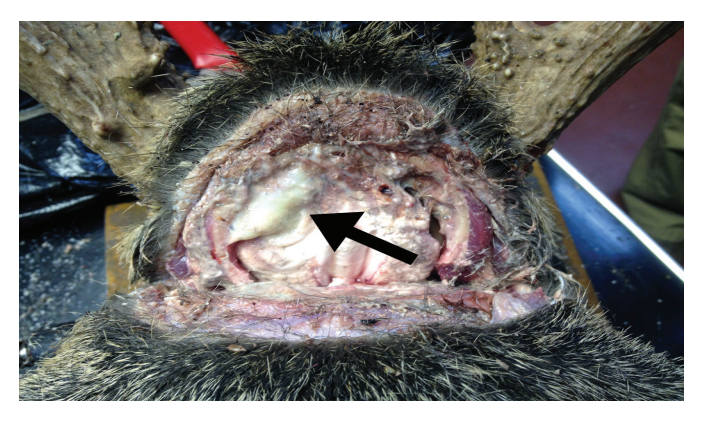
Figure 2. Brain abscesses are more commonly found in mature bucks due to intense fighting. In this photo, green pus indicates the infected area of the brain

The life cycle of infection and the process of disease transmission begins during the spring, when tick eggs hatch into the larvae stage. During the summer, the larvae feed on several host species, including mice, squirrels, raccoons, rabbits and white-tailed deer. In the fall, the larvae mature into the nymph stage. The nymphs hibernate over winter. During the spring and summer, the nymphs are active and