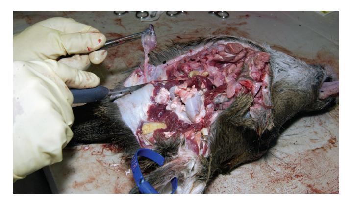
Figure 3. To test for CWD, the retropharyngeal lymph nodes, the obex of the brain or both are collected and sent for testing.

The movement and transportation of captive live animals, hunter-harvested deer or carcasses are the greatest risk factors for the spread of CWD into new areas. Natural movements of free-ranging deer can also contribute to the spread of the disease.