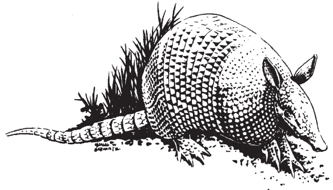
Figure 1. Armadillos are becoming increasingly common lawn and garden pests in Missouri.

While searching for food, armadillos seem oblivious to anything else and may come in close contact to humans before becoming alarmed. When startled, they jump in the air, which greatly reduces their chances of surviving an encounter with a vehicle. Armadillos travel noisily through the woods — so noisily that deer hunters in the Ozarks are often surprised that the trophy buck they heard was actually an armadillo searching for food. Armadillos can run well and are good swimmers.