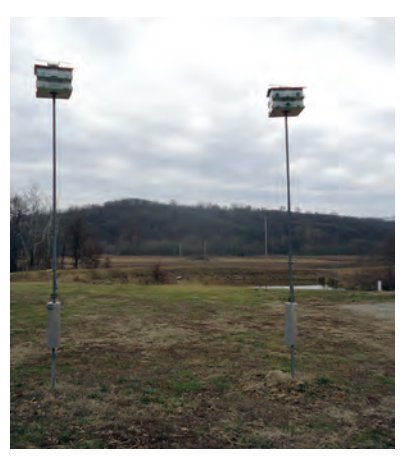
Figure 5. Martins prefer boxes located in open spaces, near water and in sight of human activity.