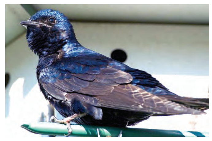
Figure 1. Male purple martin.

he purple martin ( Progne subis ) is North America's largest swallow and a beautiful songbird. Purple martins are beneficial birds to have near a home or on a property because they eat insects. These birds feed during daylight, and their diet consists mainly of beetles, moths, dragonflies, butterflies, horseflies, leafhoppers and wasps. They will also eat mosquitoes, but mosquitoes make up less than 1 percent of their diet.