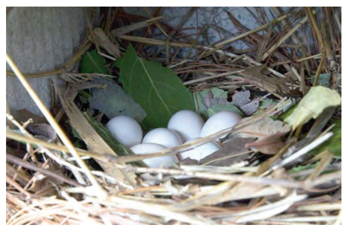
Figure 6. Females will incubate three to seven white eggs in the nest and raise one brood a year.

sparrows and starlings from using them while the martins are gone. Boxes are easier to maintain when they have easily accessible compartments and are mounted on poles that telescope.