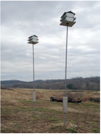
Figure 3. Large natural or plastic gourds can be used as martin houses, as can aluminum houses with larger compartment sizes. A simple stovepipe baffle attached to the pole can protect the box from predators.

nest in groups or colonies, so nest boxes should provide at least four separate nesting rooms or gourds.