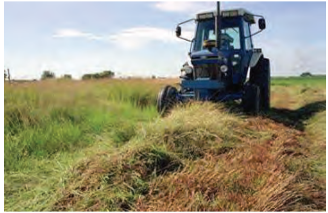
Figure 9. To retain important cover for nesting wildlife, delay harvest of switchgrass until after a killing frost, typically in late October in Missouri.

The primary value of these native grasses is the vegetative structure they provide and their bunch-like growth at ground level that allows for the germination and establishment of native forbs. These forbs produce a quality seed and attract various insects that are important food sources for many wildlife species (Figure 8). However, rank stands of these grasses will not provide this type of structural or vegetative diversity unless some sort of disturbance practice is implemented, such as a prescribed fire, disking or harvesting for hay or biomass.