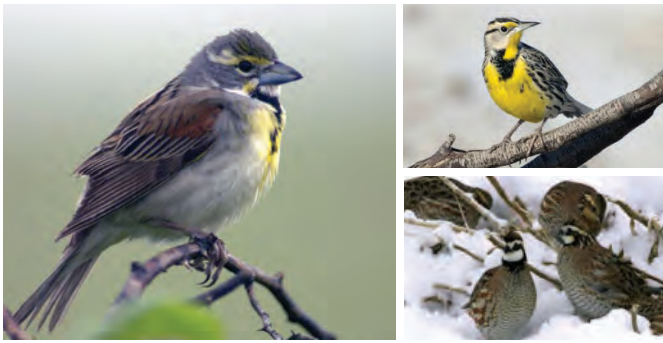
Figure 2. Populations of many species dependent on early successional plant communities — such as (clockwise from left) dickcissels, eastern meadowlarks and bobwhite quail — have been declining but can be supported through habitat management.

with proper fertilization and harvest (Figure 1). Native warm-season grasses also provide important habitats for many species of wildlife that are dependent on early successional plant communities, such as bobwhite quail, cottontail rabbits and species of grassland songbirds (Figure 2). The grasses and forbs that make up these plant communities provide structure and cover as well as food sources and pollinator habitat. Switchgrass monocultures and combinations of switchgrass, big bluestem and native forbs have been the focus of biomass projects conducted at the MU Bradford Research Center. Preliminary results of biomass and forage yields indicate that mixtures of forbs planted with switchgrass and big bluestem produced relatively equal tonnages during the year (without any nitrogen fertilizer or herbicides applied) as monocultures of these grasses produced.