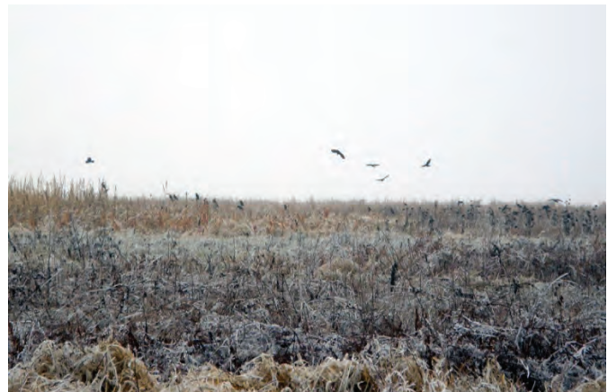
Figure 10. To retain important wildlife habitat and cover through the winter, delay harvest of switchgrass until the next spring.

Stands of switchgrass produced for biofuel can be managed to provide an important habitat component for a variety of wildlife species. Strategies to enhance wildlife habitat include delaying winter harvest so that winter cover is retained or rotating harvest so that some fields or portions of fields are harvested at two- to three-year intervals. Leaving buffer or fallow strips within and around fields also enhances habitat conditions.