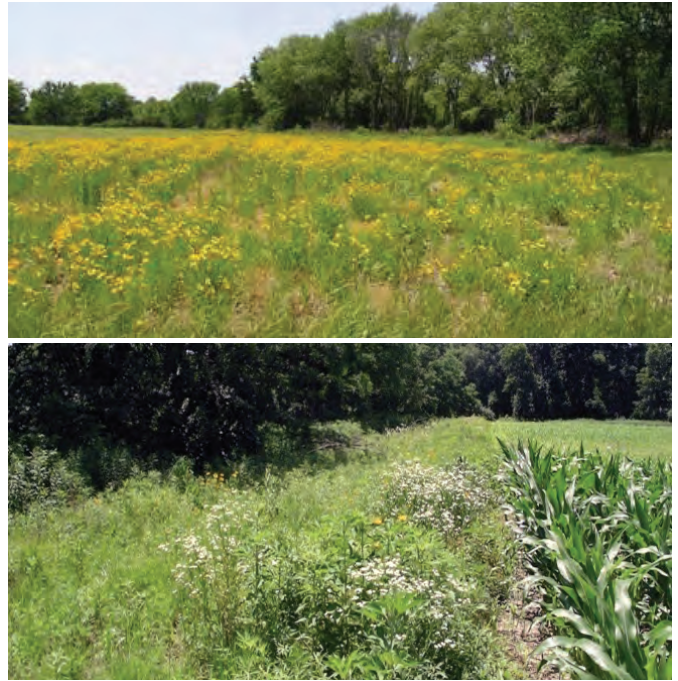
Figure 14. Planting 30- to 50-foot-wide field borders to early successional forbs and mixes of native warm-season grasses can increase food availability around the field and provide a crucial source of cover during the winter, especially if biomass crops are harvested in the fall.

Switchgrass and other grasses used for biofuels can be enhanced for wildlife by incorporating shrubby cover in the form of shrub plantings, feathered field edges or