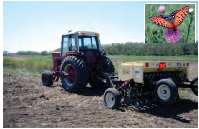
Figure 12. Planting diverse mixes of forbs together with native warm-season grasses can produce crops for biomass and enhance habitats for wildlife, including species of pollinators (inset).

Monocultures of switchgrass and other native grasses tend to be very dense and are largely free of other valuable plants such as forbs and weedy vegetation that provide important foods for wildlife. Characterized as being high-input, low-diversity (HILD), these forb-free stands of warm-season grasses, like rank stands of tall fescue,