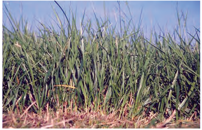
Figure 6. Stands of sod-forming grasses, such as tall fescue and orchard grass, can inhibit access for bobwhite quail and other wildlife, limit the availability of seed and invertebrates, and prevent competition of other plant species.

If retained, these native habitats can be managed to provide sources of biomass that can supplement bioenergy production, depending on the management practice conducted. Beneficial practices include removal of invasive species, haying, forest thinnings, fuel management, removal of diseased and fire scarred trees, and use of waste wood