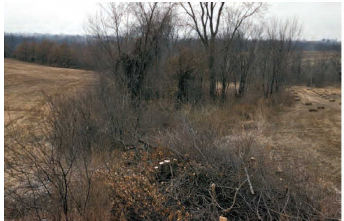
Figure 15. Edge feathering and hinge-cutting along field borders adjacent to crop fields or fields of biomass crops can enhance these areas for wildlife.

downed tree structures (Figure 14). Shrubs such as wild plum, blackberry, elderberry and sumac are extremely beneficial for wildlife and can be used to break up fields into 5- to 10-acre sections and help to create an interspersion of habitats within stands of grasses. Establishing field borders of herbaceous native forbs and legumes is also recommended. Refer to MU Extension publication G9421, Field Borders for Agronomic, Economic and Wildlife Benefits , for additional recommendations on establishing and managing field borders.