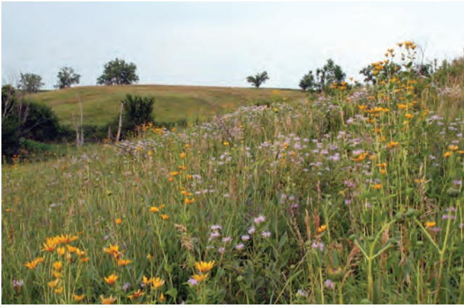
Figure 4. The plant composition of early successional plant communities, such as mixtures of native grasses and forbs, provides the vertical structure and food sources that are essential for a variety of wildlife species.