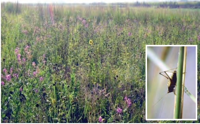
Figure 8. Native warm-season grasses grow compatibly with many species of native forbs, providing a rich diversity of cover, browse, seed, and insect foods (inset) for wildlife.

be established in strategic locations to provide structure for nesting, soft mast, browse and winter escape cover (Figure 5).