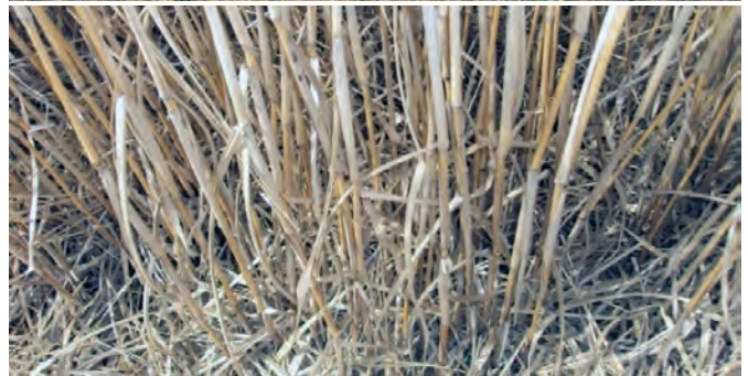
Figure 7. Miscanthus stands provide an abundance of biomass, but the mature crop's thick, dense growth provides little access for wildlife at ground level.

products. Improvements in the technologies that can use these diverse sources of biomass will expand opportunities for limited, sustainable use of native habitats for bioenergy.