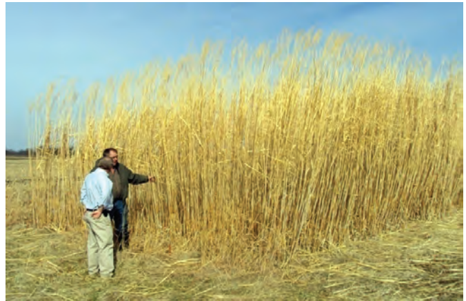
Figure 3. Missouri landowners are becoming increasingly interested in producing miscanthus as a crop for biomass.

Miscanthus giganteus , a robust, rhizomatous ornamental sterile hybrid grass, is also being considered (Figure 3). This grass has been established on several fields enrolled in the U.S. Department of Agriculture (USDA) Biomass Cropland Assistance Program (BCAP) and has the potential to produce up to 12 tons of biomass per acre each year; however, little is known about the potential values of this species to Missouri wildlife.