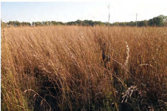
Figure 1. A variety of native warm-season grasses, such as indiangrass, big bluestem and switchgrass, are potential crops for biofuel production.

Current research in the Midwest has focused on developing cultural methods for using biomass from native warm-season grasses and introduced species, such as tall fescue or Miscanthus spp., for biofuel production. Research and demonstrations of potential biomass crops, which include native warm-season grasses and mixtures of native grasses and forbs, have been established at the