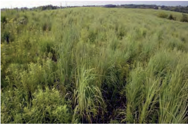
Figure 5. Scattered patches of shrubs and thickets, which commonly occur in early successional habitats, provide important areas of escape cover and food sources for wildlife.