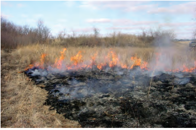
Figure 13. Prescribed fire, an effective tool for managing native warm-season grass stands, can be used to control woody invasion, stimulate desirable, or suppress undesirable plant species.

wildlife and persist better in drought conditions. A variety of species such as partridge pea, clover, alfalfa, tick trefoils and other native forbs can provide desirable mixtures that enhance an area for wildlife (Table 2).