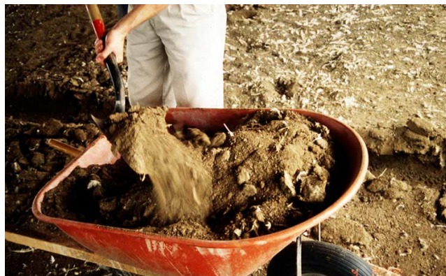
Figure 4. Be sure to crumble chunks of caked litter into small pieces and thoroughly mix the litter before removing your sample.

Often the amount of material collected from the two trenches will exceed the capacity of the wheelbarrow. When this happens, crumble and thoroughly mix the material in the wheelbarrow each time it is two-thirds full with material from the trenches. After mixing, place one shovelful in the 5-gallon bucket,