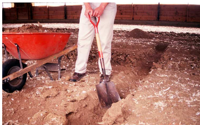
Figure 3. The trench method. Use the blade of the shovel to chop the cake so the trench has square sides down to just above the soil surface.