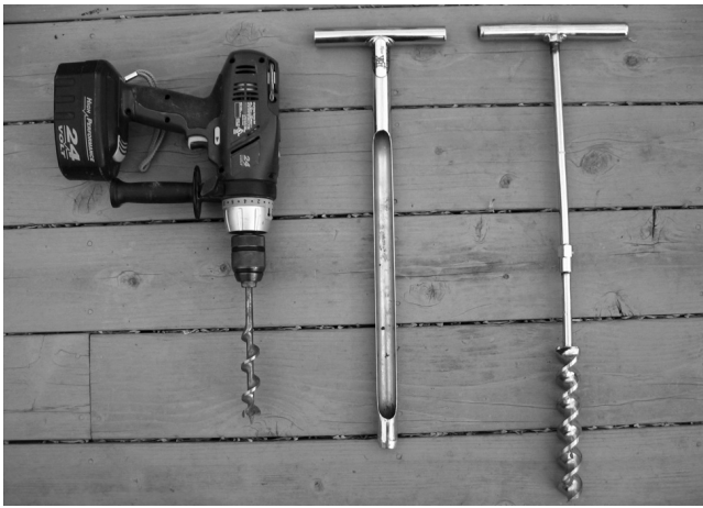
Figure 3. Coring devices are the best for soil sampling. Augers are recommended on rocky soils. Hand samplers at least 3 feet long are desirable because they reduce back strain.