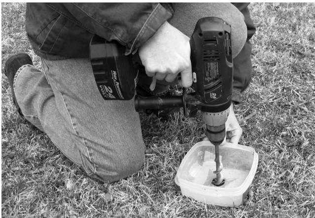
Figure 4. A power drill can facilitate sampling in rocky or dry soils. A plastic container with a hole in the middle will facilitate collecting the soil as the auger pulls it out of the ground. Empty the soil out of the plastic container into the soil sample bucket after each successful attempt to get a 6-inch core.

a power drill with an auger can be very efficient. A shovel or spade can be used if a coring device is not available. Always use clean equipment when collecting soil samples. A plastic bucket should be used for collecting and mixing samples. Metal buckets or containers can contaminate the soil with micronutrients.