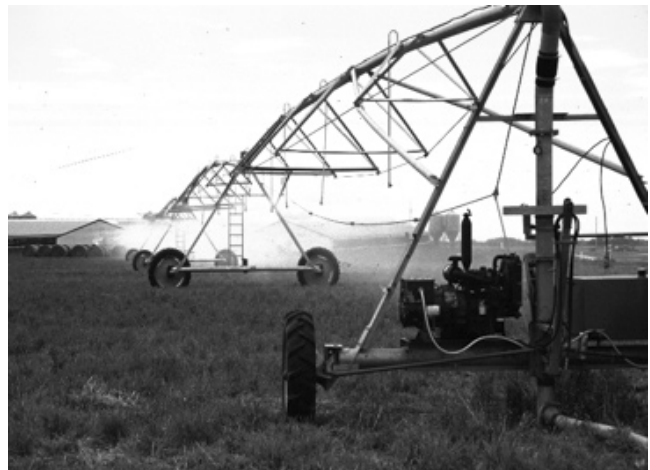
Center-pivot irrigation system for applying liquid manure.

Manure contains both organic nitrogen and mineral forms of nitrogen. The organic nitrogen is an integral component of cells in organic material in the