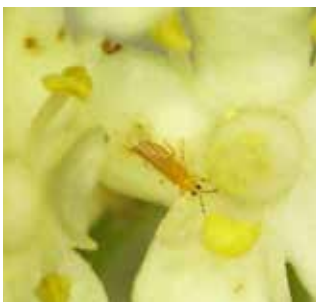
Figure 8. Eastern flower thrips ( Frankliniella tritici ) on elderberry flower.