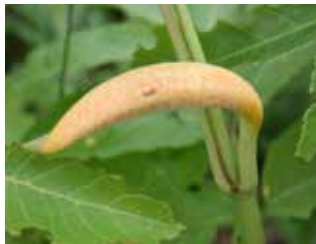
Figure 13. Elderberry rust ( Puccinia sambuci ) on leaf petiole.