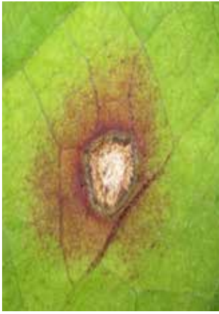
Figure 15. Alternaria sp. lesion on an elderberry leaflet at an early stage of infection.