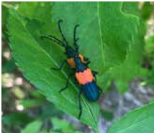
Figure 7. Elder borer beetles ( Desmocerus palliatus ).