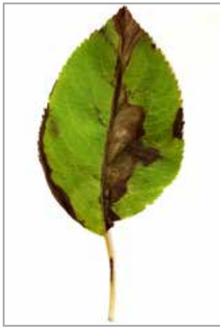
Figure 16. Elderberry leaflet infected with Alternaria in the summer.