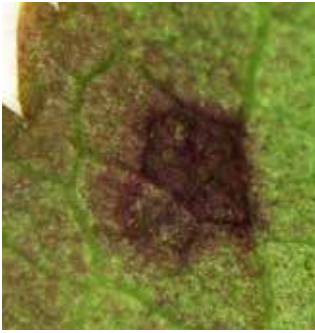
Figure 18. Colletotrichum kahawae subsp. ciggare lesion on elderberry leaflet.