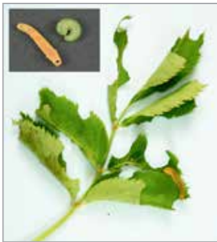
Figure 3. Sawfly larvae and their feeding on elderberry.