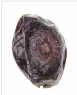
Figure 17. Shriveled berry symptom of Alternaria .