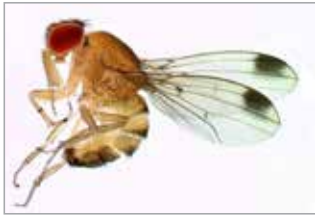
Figure 10. Adult spotted wing drosophila ( Drosophila suzukii ).