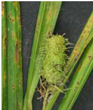
Figure 14. Elderberry rust lesions on the alternate host, sedge.