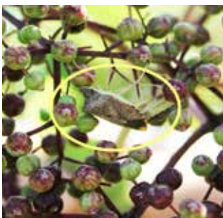
Figure 6. Stink bug feeding on an elderberry drupe.