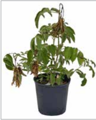
Figure 12. Cane dieback disease ( Heterophoma novae-verbascicola ).