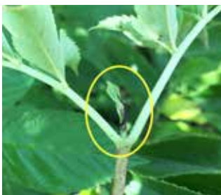
Figure 5. Necrotic growing point at elderberry shoot apex caused by Jessie's bug.