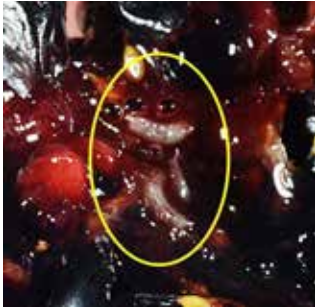
Figure 11. Spotted wing drosophila larvae in blackberry fruit.