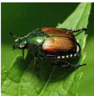
Figure 9. Japanese beetle ( Popillia japonica ).