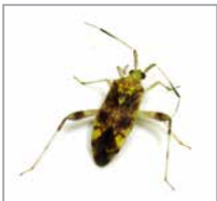
Figure 4. Jessie's bug ( Neurocolpus jessiae ).