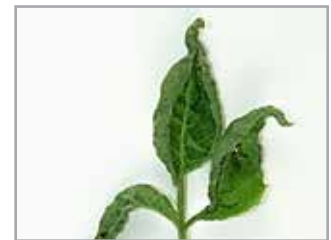
Figure 1. Inward leaflet curl caused by eriophyid mites ( Phylloctptes wisconsinensis ).