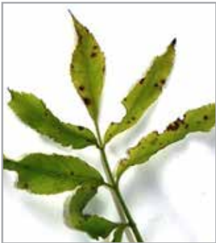
Figure 19. Colletotrichum acutatum disease symptoms on elderberry.