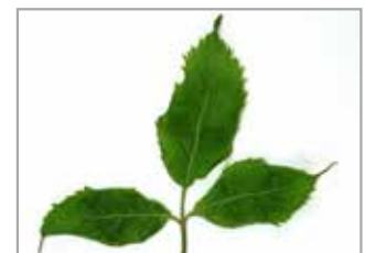
Figure 2. Stunted leaflets with interveinal puckering caused by eriophyid mites ( Phylloctptes n. sp. ).

Written by Michele Warmund , State Fruit Specialist, Division of Plant Sciences