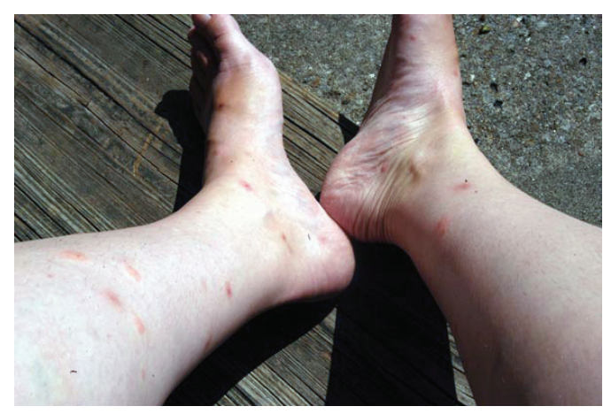
Figure 2. Fleas often target the legs and ankles when they bite humans.

about ¼6 inch long and will grow to a length of ¼ inch. They grow by molting, or periodically shedding their skin. They pass through three molts and are fully developed in eight to 24 days. Larval growth can be prolonged to more than six months under adverse conditions. Flea larvae live in floor cracks, rugs, carpets and animal bedding. They are legless but move using bristles on their body. Larvae prefer dark, moist environments where they feed on a variety of organic debris, such as dry feces from adult fleas, pet feces and particles of pet food.