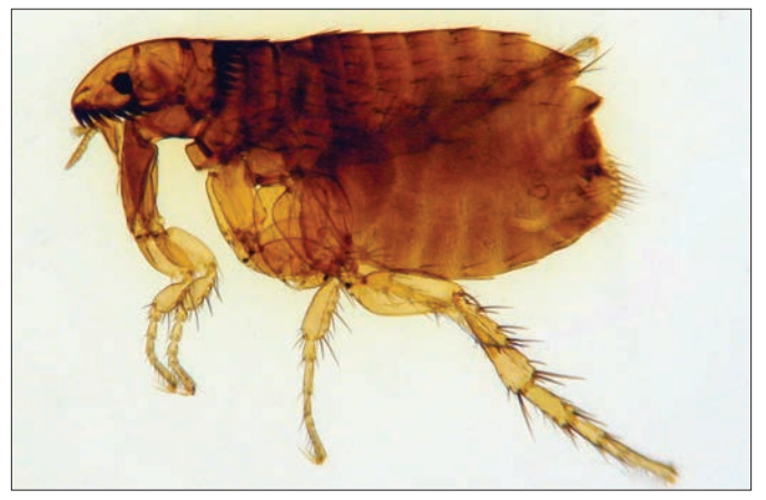
Figure 1. The cat flea, Ctenocephalides felis.

and stings of other arthropods. Spiders leave two marks when they bite, and the bites of mosquitoes, bees, wasps and bedbugs normally produce a large swelling or welt.