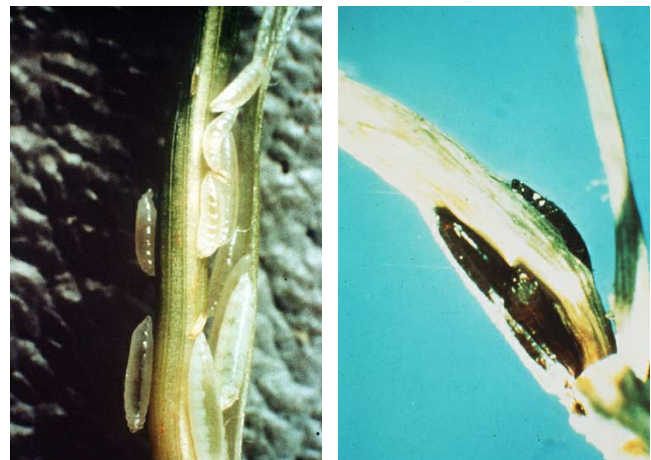
Figure 1. Hessian flies overwinter as larvae (left), which develop protective shells, or puparia, called flaxseed (right).

“flaxseed” (Figure 1, right) The flaxseed stage persists during the summer until volunteer wheat or early-planted wheat is present. Annually, there are two generations in Missouri unless wet conditions permit an extra spring or summer generation. This insect will also attack barley and rye, but wheat remains its favorite host.