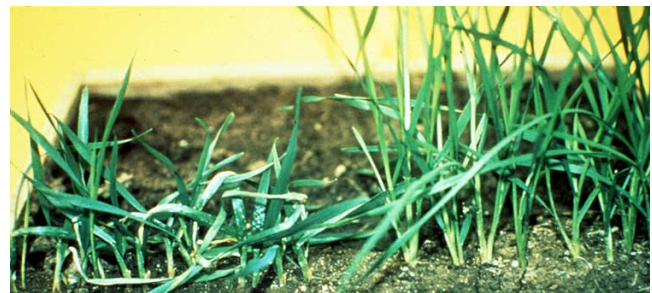
Figure 3. Plants infested with Hessian flies become stunted and thickened (left) whereas resistant varieties (right) resist attack.

5. Practice crop rotation. This is an effective management tool because of the insect's limited host range.