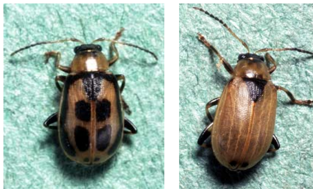
Figures 1 and 2. Bean leaf beetle adults. Note characteristic black triangle at base of forewings.

ically important. Defoliation by adult bean leaf beetle is identifiable by the small round holes between the major leaflet veins (Figure 3). This damage differs from the larger, irregular holes or jagged leaflet margins caused by caterpillars and grasshoppers. Even though soybean plants may sustain more than 50 percent foliage damage, plants can generally compensate unless damage occurs during the reproductive growth stages.