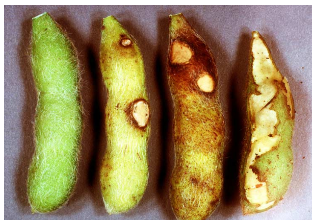
Figure 4. Bean leaf beetle adult and pod damage.

As soon as soybean seedlings emerge, it is important to scout fields weekly for bean leaf beetle infestations. Scouting procedures are targeted at the adult stage because sampling for the larvae is expensive, labor intensive and time consuming. Direct observations along with stand counts can be used early in the season. By midseason, either sweep nets or drop cloths are effective sampling tools. Adult bean leaf beetles are shy and when disturbed will drop to the ground or onto lower leaves. When caught in a sweep net, they usually remain at the bottom of the net hiding underneath leaves or within the folds of the net. Counts of adults as well as damaged pods are useful tools for determining insecticide applications later in the season.