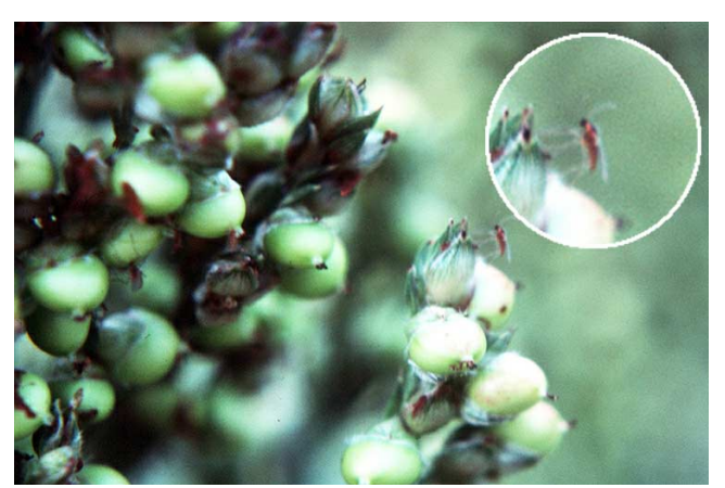
Figure 1. Adult sorghum midge on seed head.

and adults are most active on the flowering heads. Because midge adults are poor flyers, infestations generally start along field borders downwind of alternate host plants. If few midge adults are present in these areas, there is little need to scout the entire field. But, when midge populations approach or surpass the threshold level in the upwind areas, sample 100 seed heads (10 each at 10 locations) per field. Since a new midge brood appears each day during pollination (7–9 days for an individual seed head), fields should be inspected daily. Visual inspection of the whole seed head is the best sampling method. Another method is to place a piece of white cardboard or paper underneath a seed head, vigorously tap it to dislodge the adults, and then count