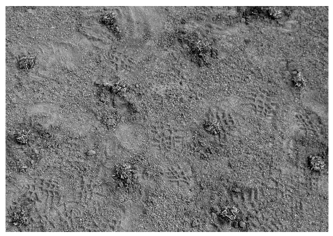
Figure 3. Press the plugs into the holes by foot or by light tamping or rolling to ensure good contact with the soil.

less expensive than plugging and may give a faster rate of cover. However, sprigs require more initial and post-planting care than do plugs and are less likely to survive under adverse conditions.