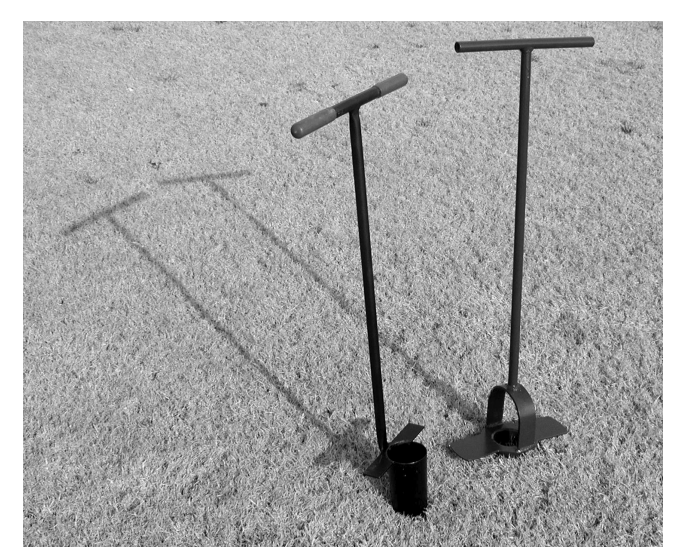
Figure 1. Use a long-handled bulb planter, or plugger, to remove soil cores before planting zoysiagrass plugs.

The term "sprig" refers to a portion of the zoysiagrass plant that includes a short piece of the stolon or rhizome, roots and leaves, but not soil. Sprigging is