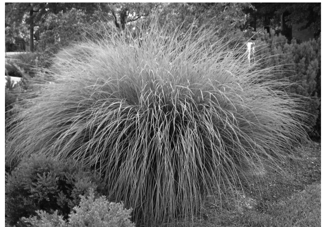
Figure 1. Like many other ornamental grasses, maiden grass requires little care and adds interest to garden landscapes.

Ornamental grasses can also be classified according to their growth habit. Most ornamental grasses form clumps, rendering them noninvasive and suitable for use as specimen plants or for massing. These grasses exhibit a wide array of architectural forms, including tufted, mounded, upright, upright divergent, arching and upright arching (Figure 2). The shortest ornamental grasses usually exhibit a tufted habit of growth, and the tallest are upright arching in form. A second classification of ornamental grass according to their growth habit is spreading, or running. These grasses creep or