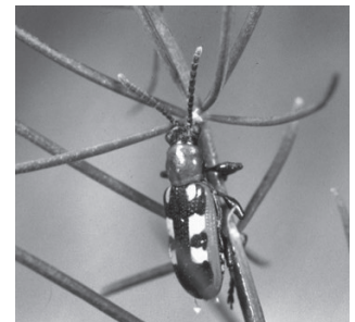
Figure 3. Common asparagus beetle.

The most significant insect pest of asparagus is the asparagus beetle (Figure 3). The asparagus beetle is about ¼ inch long with bluish black wing covers and creamy-yellow spots with red borders. The asparagus beetle overwinters as an adult in crop residue or trash around the garden or field. As soon as the spears emerge in the spring, the asparagus beetle begins feeding on the spear tips and laying eggs on the spears. Both the feeding damage and the presence of eggs make the spears unmarketable. On a small-scale planting, asparagus