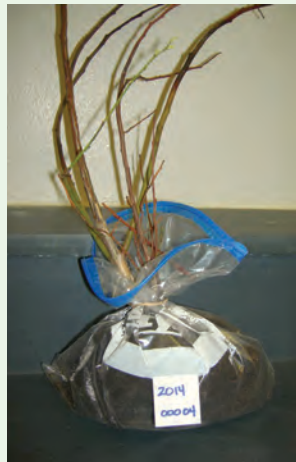
Regular sample packaging. Enclose roots and soil in a plastic bag before shipping.

Delays in mailing can cause deterioration of plant samples. Mail samples early in the week to avoid delaying delivery over a weekend. For highly perishable items, always consider overnight delivery.