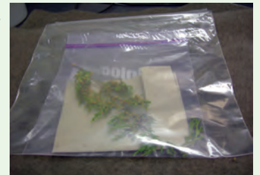
Regulated pest packaging. Double-bag samples of regulated pests.

Place the double-bagged sample inside a sturdy box, and add packing material to reduce movement. Seal all seams of the box with packaging tape. Samples should be hand-delivered or sent by overnight delivery to the clinic. As a last step, notify the clinic that a package of regulatory concern has been shipped.