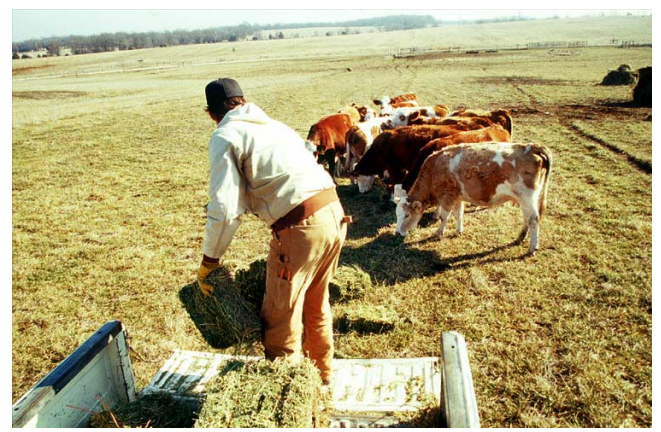
Figure 6. To minimize losses with small square bales fed on the ground as loose hay, distribute daily amounts throughout a pasture.

No matter what size hay package or feeding style you use, some hay will be lost or wasted. Proper feeding management minimizes these losses. Since hay is some of the most expensive feed used on beef operations, it makes sense to try to keep waste as low as possible through good management practices.