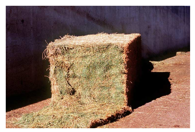
Figure 5. Large square bales can be efficiently transported and handled but require a large initial investment in equipment.

Formed haystacks have declined in popularity over the past 15 years. As with large round and large square bales, formed haystacks are designed to minimize handling and feeding costs. The stacks are often as large as 12 feet tall and contain 3 to 6 tons of hay. These bales