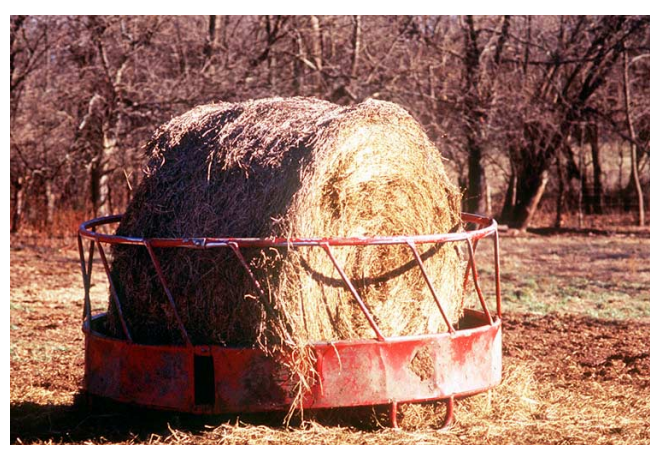
Figure 2. A hay ring permits feeding of large round bales in the field with minimal loss.

rings usually cost about $125 each), but feeding losses are low, even if a seven-day supply of hay is left at one time (Table 1). Feeding hay in racks or rings is crucial for producers who do not or cannot feed hay to their cattle on a daily basis.