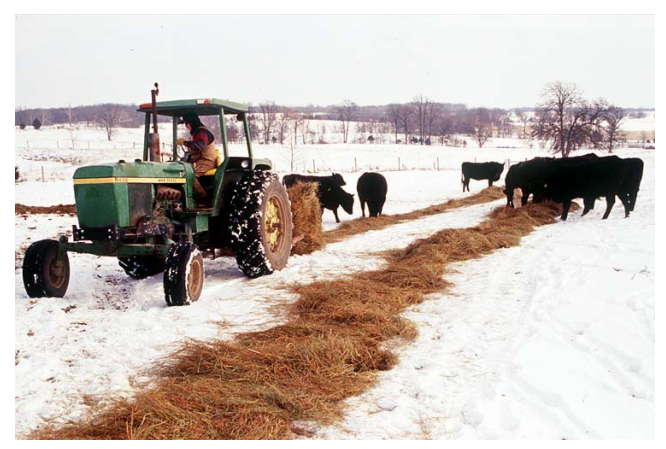
Figure 4. When large round bales are unrolled and fed on the ground as loose hay, losses as high as 40 percent can be expected.

or processing bales is that it gives you the opportunity to move the hay feeding areas around the pasture and distribute manure and nutrients evenly over a large area.