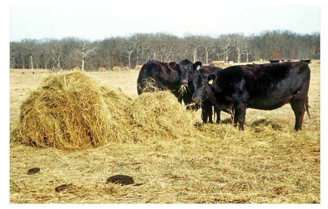
Figure 1. Losses can run as high as 50 percent if hay is not fed properly.