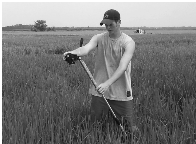
Figure 2. Digital images should be collected at a standard height for calculating plant area in a rice field.

Digital cameras can also be used to estimate rice plant area for making midseason N decisions (Figure 2). The major disadvantage of this method is the cost of the computer software for scanning images. In the Delta Center tests, a camera was mounted on a 5-foot rod held above the plot. Digital images were recorded 1 to 2 days before panicle differentiation. The rod was tilted at a 45-degree angle and the camera rotated to be level with the soil surface. A computer macro program developed at University of Arkansas was used with Sigma Scan™ Pro 5.0 image software (Aspire Software International, Asburn, Va.) to determine the percentage of green pixels in each photo.