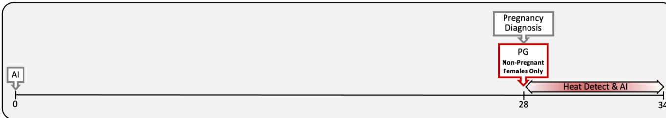
Figure 3. If an accurate early pregnancy diagnosis is performed after a first AI service, one approach to facilitate a second AI service is to administer PG to all cows that are confirmed nonpregnant at the time of an early pregnancy diagnosis. This can be performed as early as 28 days after the first AI service as show here. Note that PG should only be administered to females confirmed as nonpregnant. Estrus detection and AI may be performed in the subsequent days. A long period of estrus detection will likely be required (approximately 6 to 7 days, as show here), and not all nonpregnant females administered PG for resynchronization will go on to express estrus.