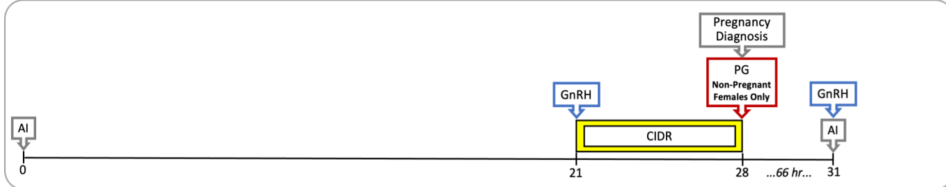
Figure 4. With careful planning, a resynchronization protocol can be scheduled so that the final step of the protocol occurs on the same day as an early pregnancy diagnosis. Seven days prior to pregnancy diagnoses, a CIDR is inserted and GnRH is administered to all females. On the day of pregnancy diagnosis, the CIDR is removed from all females. Note that PG should only be administered to females confirmed as nonpregnant.