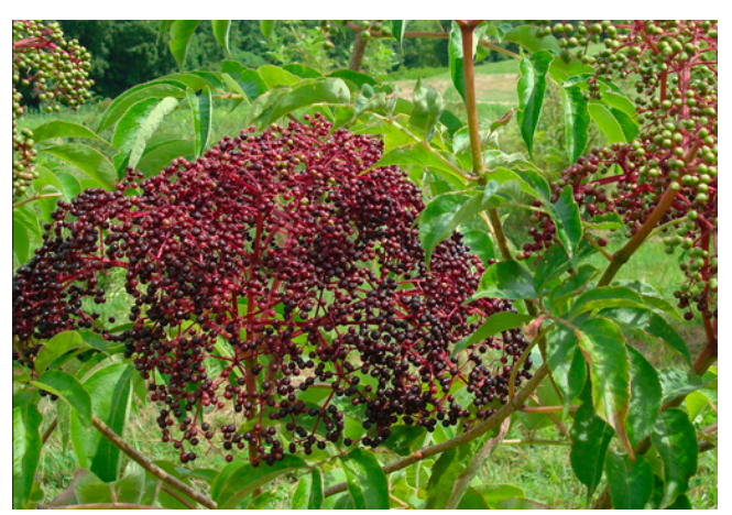
The fruit of the American elderberry