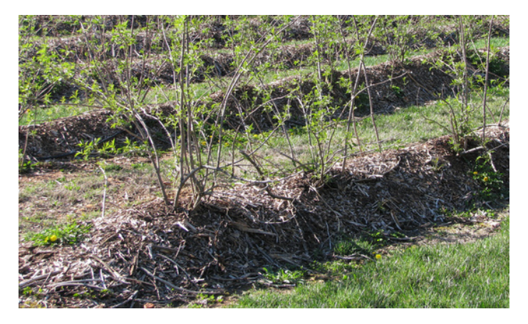
A bermed elderberry planting

Pre-plant soil testing is recommended to evaluate the soil pH and nutrient levels. Adjust pH level to 5.5-6.5, phosphorus level to 50 lbs/acre, and potassium level to 200-300 lbs/acre. Although elderberry tolerates cold temperatures following bud break, it is best to select sites that are elevated relative to surrounding land to reduce the risk of damage from spring frost. Elderberry requires full sun for optimum protection. Control problem perennial weeds such as bermuda grass, johnson grass, blackberry and poison ivy before elderberry. Establish planting а noncompetitive ground cover in the alleys between rows to facilitate operations in the planting.