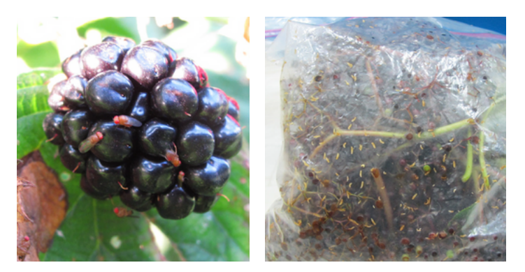
Spotted wing drosophila on blackberry fruit (left); SWD larvae in elderberry fruit (right)

Other insect pests in elderberry include the larvae of fall webworms ( Hyphantria cunea ), cecropia moth ( Hyalophora cecropia ), both of which may defoliate plants, and aphids. The currant borer, a clearwing moth ( Ramosia tipuliformis or Synanthedon tipuliformis ) and elder shoot borer ( Achatodes zeae ) have also been documented as damaging elderberries, but have not been associated with severe economic damage in Missouri.