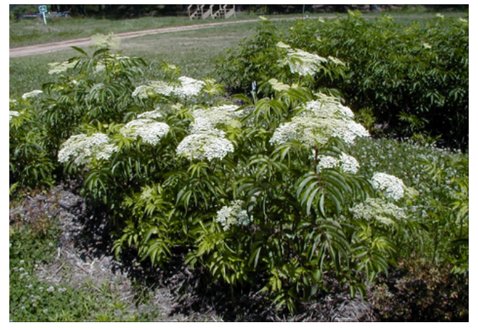
The blossoms of the American Elderberry