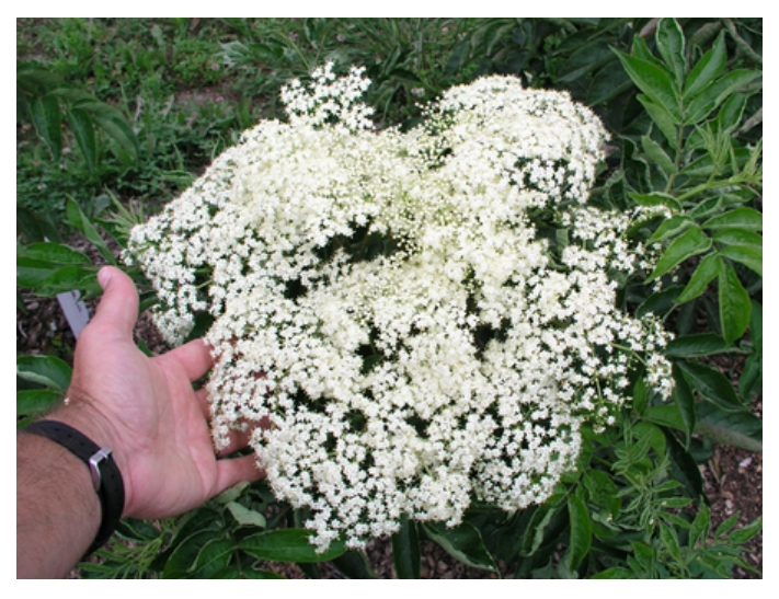
Harvest elderberry blossoms when all flowers are open.

Elderberry fruit harvest takes place in late-July, August, and early-September. At present the Missouri elderberry crop is harvested by hand. Entire cymes are clipped and harvested when all berries are fully colored. The cymes on the current season's shoots ripen several days later than cymes on older wood. Plants that were pruned to the ground the previous winter will usually ripen fruit over 2 to 3 weeks, whereas plants with shoots of mixed age will ripen over a 3 to 4 week period.