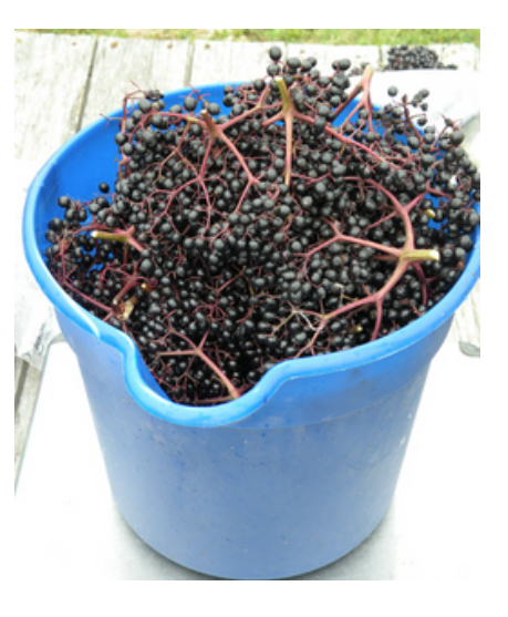
Elderberry fruit are harvested when all berries in the cyme are fully colored.

Harvest plants at weekly intervals. Harvest early in the day for best fruit quality. CAUTION : Be careful when picking elderberries from the wild, as the railroad and road crews often spray just before they are ready to harvest. Yields may range from 2 to 4 tons per acre for mature bearing plantings, though higher yields have been recorded. Harvested fruit is highly perishable; refrigerate at 32-40°F as soon as possible after harvest.