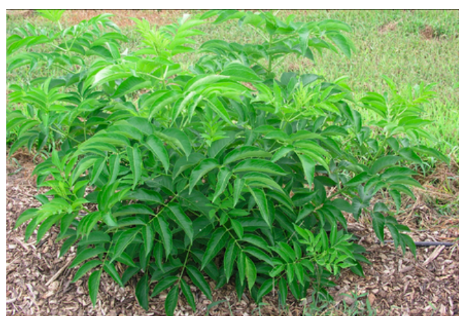
The American Elderberry plant

European elderberry (Sambucus nigra) is grown as a commercial fruit crop in Europe and elsewhere. The American elderberry, however, appears to be a better candidate for commercial production in Missouri. This guide outlines production practices and market information for American elderberry, based on research and growers' experiences in Missouri. It is important to note that elderberry remains significantly underdeveloped as a commercial crop. Not very much is known about several aspects of elderberry production, including