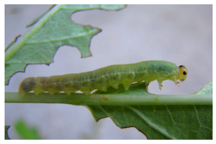
The larva of the elderberry sawfly

Producers must understand that this pest is not a true caterpillar; therefore, certain common control measures for moth and butterfly caterpillars are ineffective against it.