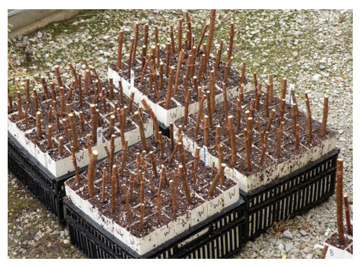
Hardwood cuttings in individual containers

Collect vigorous 2-4 node cuttings from the previous season's growth before budbreak, which typically occurs by early-February. Be sure that the cuttings are not cold-damaged and are free of defects. Cuttings may be rooted immediately or stored under refrigeration for 4-6 weeks for later rooting. A dip of the basal end of the cutting in a commercial rooting powder (0.1% IBA) may increase rooting. Place the basal node(s) below the surface of a well-drained soil or sterilized commercial potting medium. Keep cuttings warm and moist but not wet. The cuttings will usually break bud and begin growing several weeks before rooting, but should be well-rooted within six weeks.