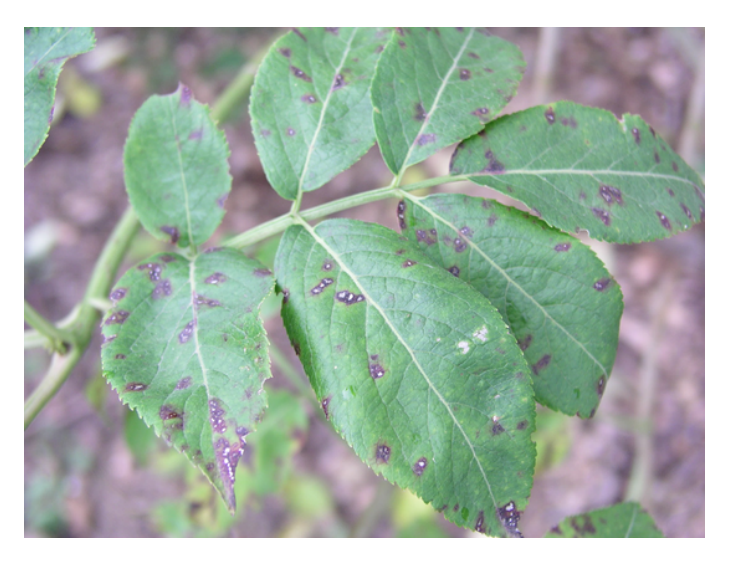
Bacterial spot on elderberry foliage

A bacterial leaf spot disease tentatively identified as Pseudomonas viridiflava (see image below) has caused economic damage to elderberry in Missouri. Little is known about this disease or how to manage it.