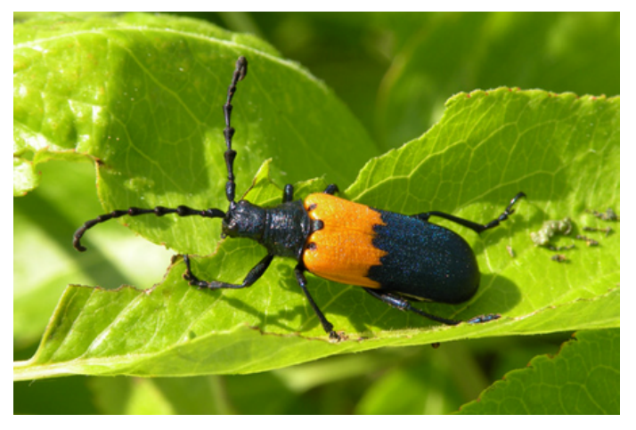
Elderberry longhorn beetle adult

Elderberry longhorn beetles, also known as elder borers ( Desmocerus palliatus ), feed on foliage and flowers as adults (see above image) and bore into the stems and roots as larvae. This boring may cause weakness, breakage, or death of stems. These beetles are often present in elderberry orchards in early-summer, but not usually in economically significant numbers. Hand removal of the adults may be an effective control measure in small plantings. Economic threshold numbers are unknown for elder borer; however, commercial producers should carefully monitor populations and be prepared to control them if damage is significant.