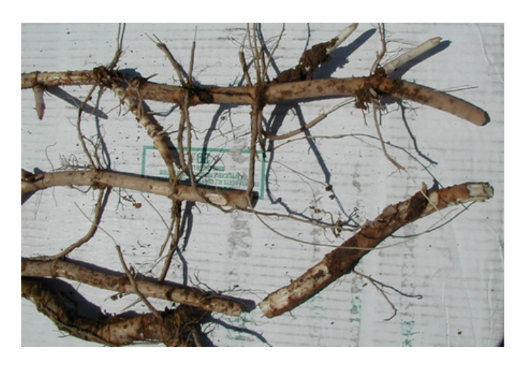
Elderberry root cuttings

Softwood cuttings typically root well until about July 1; rooting percentage drops as the summer progresses. Root cuttings (pencil diameter or slightly smaller, 4-6 inches long) may be dug in late February before growth begins (Fig. 6). The root cuttings are placed horizontally in a flat or pot, covered with 3/4 to 1 inch of a light soil or soilless medium and kept warm and moist. Often, a single root cutting will produce 2-3 plants.