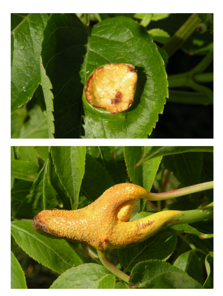
Elderberry rust on leaf blade (top) and petiole (bottom)

Birds of several species will feed on elderberry fruit and can cause significant crop losses; those selections with pendulous (downhanging) cymes appear to be less attractive to birds.