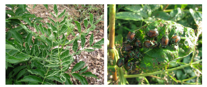
Foliar injury from eriophyid mite (left); Japanese beetle adults and feeding injury (right)

Eriophyid mites (Phyllocoptes spp.) are microscopic pests that cause cupping and crinkling of the foliage (see first image), and can destroy florets and young fruit in severe infestations. Little is currently known about this important pest, including how best to control or manage it. Eriophvid mites overwinter under buds and bud scales on above-ground portions of the plant; therefore gathering and burning pruned branches in winter may help reduce populations of this These mites may be easily pest. and unknowingly spread by transporting dormant cuttings for propagation.