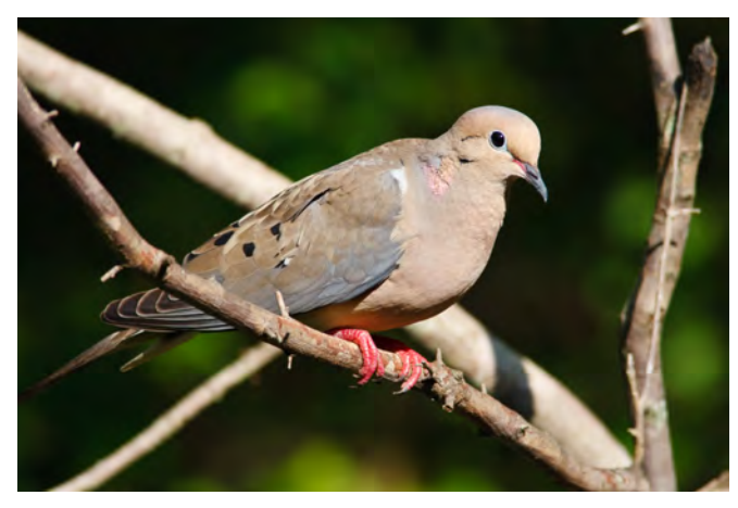
A Mourning Dove perched in a tree