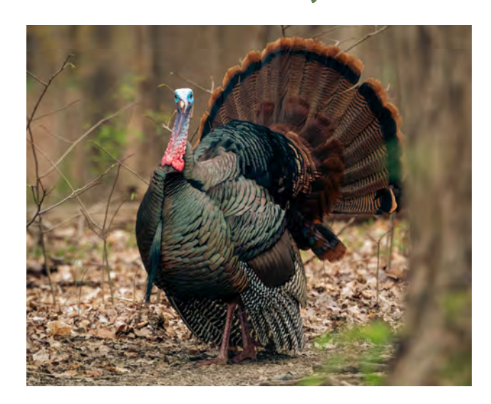
Eastern wild turkey in wooded area