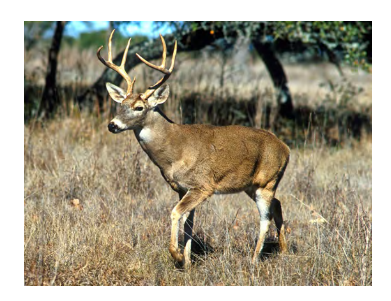
White-tailed deer prefer to use habitats with an abundance of forest or woodland edge, as opposed to large, dense areas of forest. Farms with small wood-lots, forested riparian areas and woody draws mixed with crop fields provide excellent habitat for deer, and for this reason deer populations have thrived in agricultural areas.

will vary with habitat quality, deer density, sex, time of year and the deer's age. Deer that live in better habitats (ample amounts of food and cover) often are able to satisfy all of their daily requirements in a smaller area, while deer that live in less diverse habitats usually must travel greater distances to find suitable food and cover. An adult buck will usually have a larger home range than does and young bucks; however, this is dependent on the time of year and the overall quality of the habitat. Home range refers to the area used by a deer throughout a given timeframe or season. By providing the appropriate mix of cover types on your property, you can begin to manage for all the habitat needs of deer throughout the year.