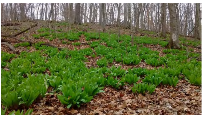
Top: An alley cropping system; Bottom: Ramps in a food forest system.