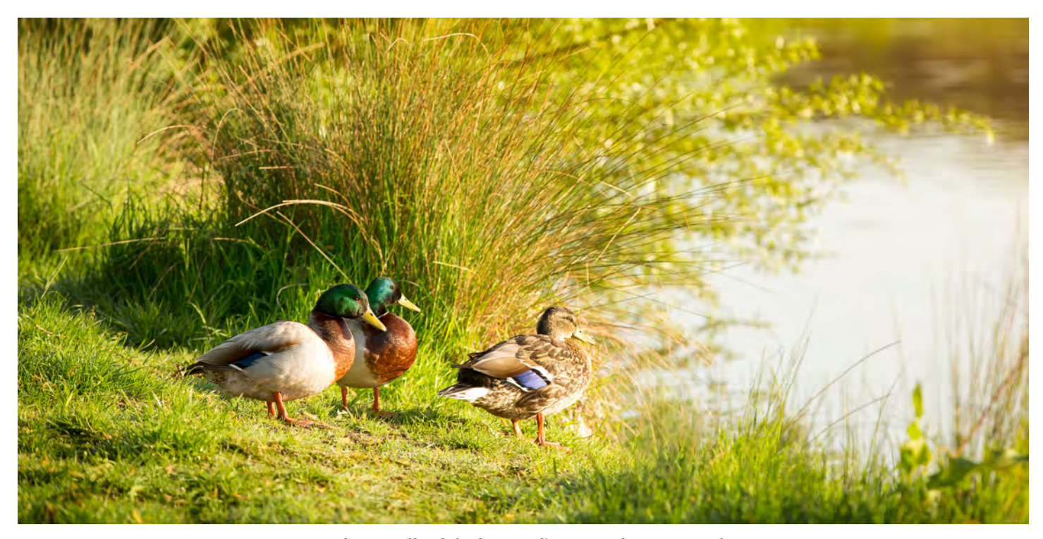
Three mallard ducks standing near the water's edge