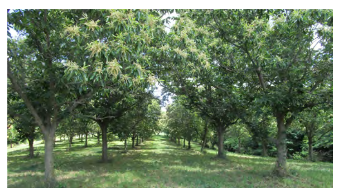
Alleyway between chestnut trees

Riparian Forest Buffers: While sound water conservation is being practiced, valuable wood products are growing and significant roosting and resting areas are provided