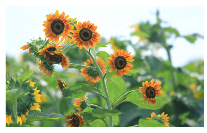
Sunflower crop at South Farm Research Center in MO