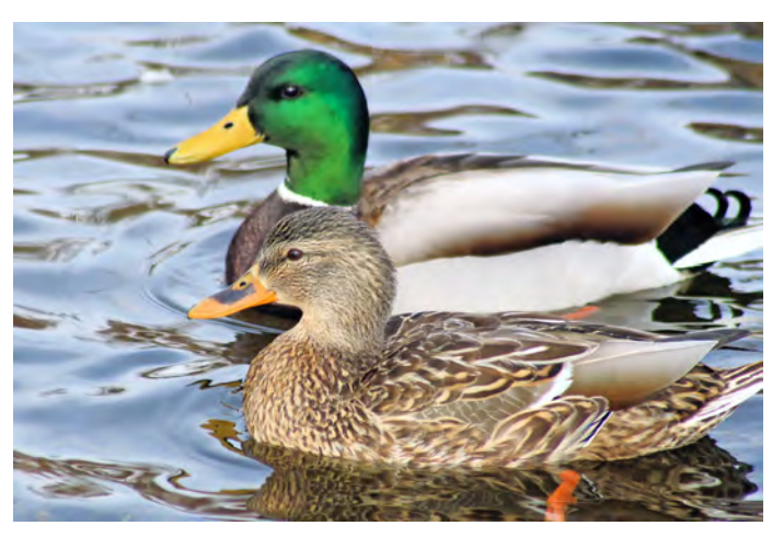
Ducks swimming in a pond

Missouri is home to a few resident waterfowl species, including giant Canada geese and wood ducks. Most waterfowl that utilize Missouri wetland habitats are migratory. Many of these waterfowl species nest in the prairie pothole region of the northern Great Plains and