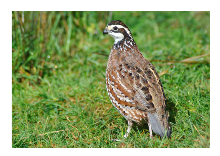
Bobwhite quail require early stages of plant succession