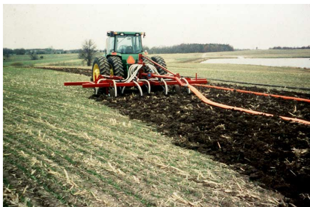
Figure 1. This hose-fed machine practically eliminates the odor from land application of liquid manure by injecting the manure into the soil.

Table 1 shows the buffer distances (the minimum distance between the nearest confinement building or lagoon and any public building or occupied residence) required by the Missouri Department of Natural Resources (MDNR).