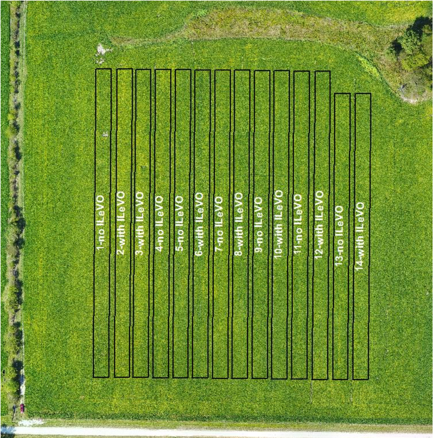
Figure 1. Aerial photography taken September 7, 2017, showing strip trial layout in the field.