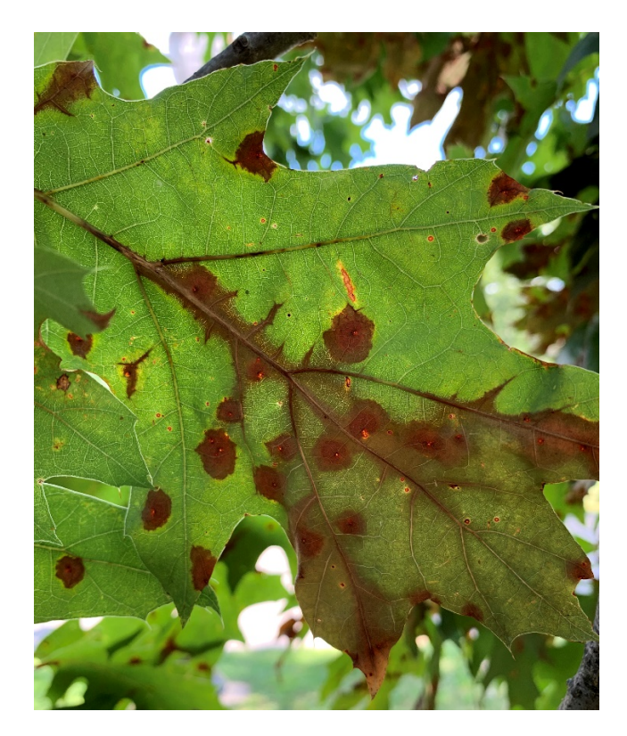
Figure 1. Early-stage symptoms on a red oakleaf.

An excessively wet spring, a late frost and a moderate summer contributed to increased incidence of Tubakia leaf spot disease on oak trees this year. This disease predominantly infects Oak species with latent symptoms of dark red to brown spots on leaves appearing in mid to late summer. For appropriate diagnosis, the MU Plant Diagnostic Clinic can help you confirm if your plant has this fungal disease.