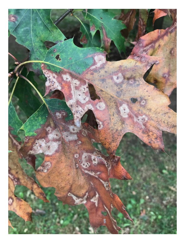
Figure 2. Advanced symptoms on red oak leaves.

Life cycle : The spores (conidia) of Tubakia spp. overwinter on infected twigs and leaves, either attached to the tree or on the ground. Spring wind and rain splash spreads fungal spores and infects trees early in the season. Infected trees may remain asymptomatic until mid to late summer, or early fall.