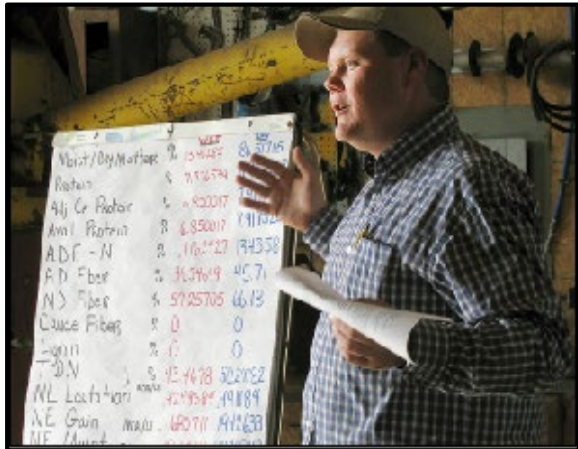
Use analysis to balance rations