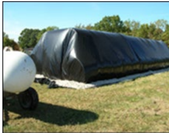
Ammoniation an option to increase feed value