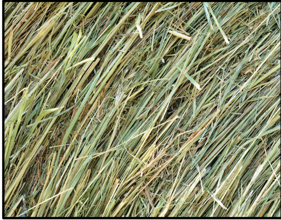
Expect low nutritive value