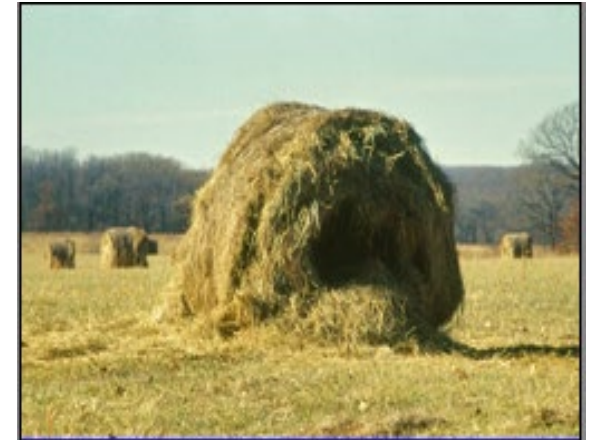
Limit access to minimize feed waste