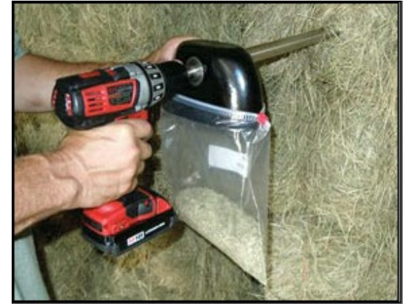
Test for protein and energy