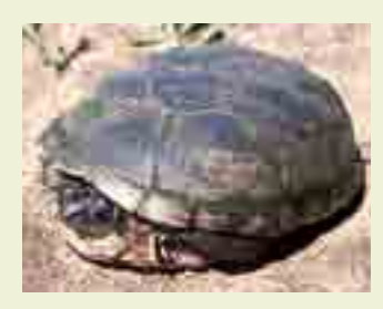
Illinois mud turtle

The yellow mud turtle prefers a sandy habitat and spends as much time on land as in the water. Aquatic habitat includes marshes,