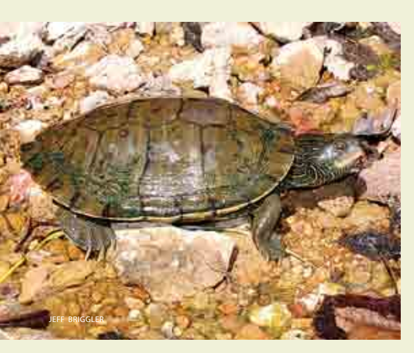
Missouri Distribution: Occurs primarily in the Ozark region of Missouri and upper Mississippi River in northeastern Missouri

Due to limited numbers and a reduction of natural habitats, this species has been listed as endangered in Missouri.