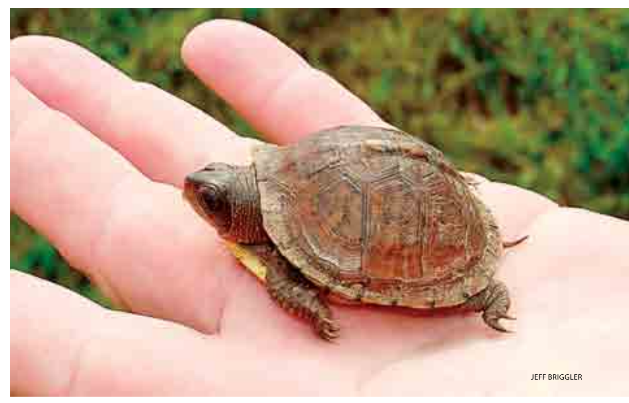
Above: This hatchling box turtle is one of two species of hard-shelled land-dwelling turtles. Left: Turtles need to bask in the sun to increase their body temperature for digestion and assimilation of food and to expose their skin to ultraviolet rays which, in turn, produces vitamin D. Basking also helps female turtles to accelerate egg development.

slider, can live in nearly any natural or constructed body of water—as long as there is ample aquatic vegetation for both food and security, and suitable basking sites. The alligator snapping turtle, a declining species and the largest species in Missouri, lives in large rivers where adequate food (mostly fish) and cover (deep holes with root snags) can be found. The various map turtles thrive in headwater streams and the clear, cool rivers of the Ozarks where the turtles can find their favorite foods: snails, naiads and crayfish. Life on the land has allowed box turtles to have a diversified diet: insects, earthworms, land snails, mushrooms, berries and young shoots of various plants. Turtles do not have teeth; they were lost eons ago through the process of evolution. Both the upper and lower jaws are covered with a sharp-edged beak. The lower jaw fits inside the upper jaw, thus, allowing turtles to use their jaws like scissors to bite off bits of food.