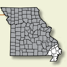
Missouri Distribution: Statewide, except for the southeastern corner of the state, and is more common in the western and northern parts of Missouri