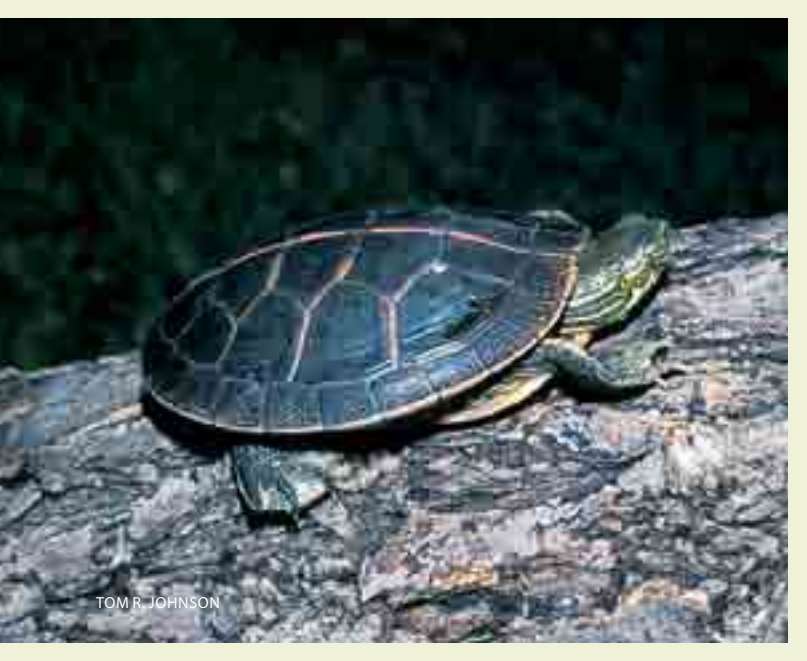
Missouri Distribution: Southeastern Missouri

This colorful turtle eats aquatic plants, snails, crayfish, insects and some fish.