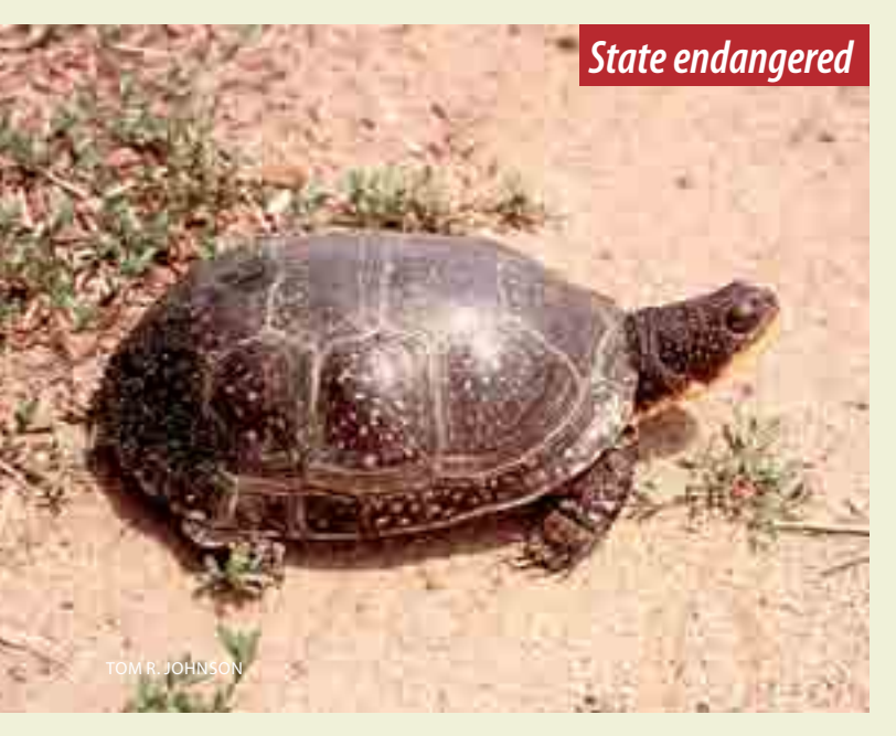
Missouri Distribution: Occurs in a few counties in extreme northeastern Missouri and one county in extreme northwestern Missouri