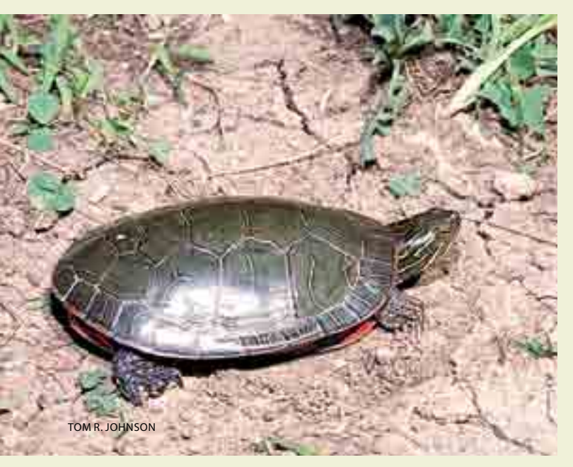
Missouri Distribution: Occurs statewide, especially prairie regions, except for southeastern counties