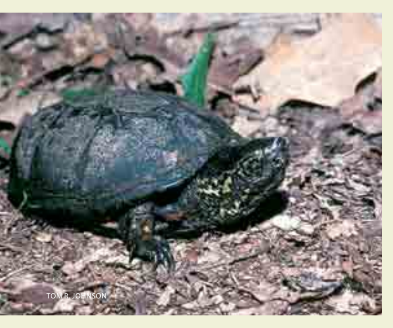
Missouri Distribution: Restricted to the counties of the Mississippi lowlands of southeastern Missouri

The yellow mud turtle and its geographic race—the Illinois mud turtle—are protected as endangered species in Missouri.