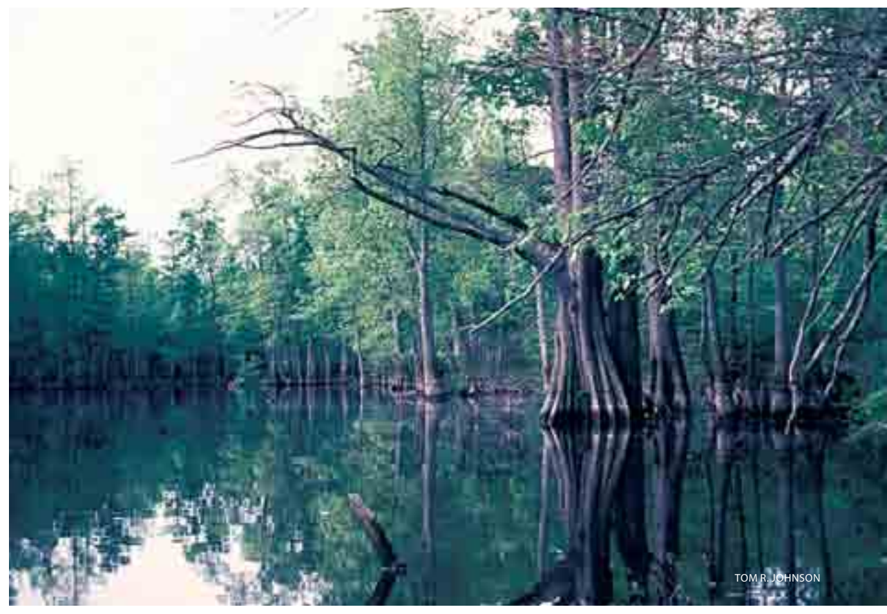
Natural wetlands, such as emergent marshes (left) in northern Missouri and bottomland cypress swamps (above) in southeastern Missouri, are important habitat for a variety of Missouri's turtles.