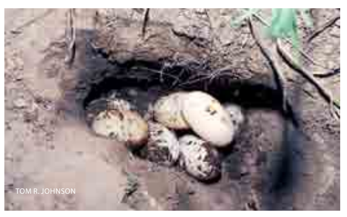
These map turtle eggs are on a bank along the Big Piney River. All turtles lay eggs on land.

All turtles lay eggs on land. Females are particular about where they lay and bury their eggs and may travel long distances overland to find a suitable location. Most turtles select well-drained, sandy or loose soil to deposit their eggs. The sites usually face south or southeast. Turtle eggs may be hard- or soft-shelled, round or elongated, depending on the species. Stinkpots, mud turtles and softshells lay hard-shelled eggs, which contains a