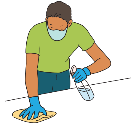
Sanitize commonly touched surfaces.