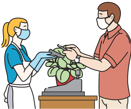
Practice zero-contact transactions.

Protect the customer as well as yourself and your coworkers.