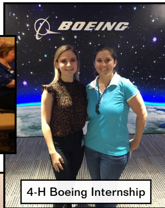
4-H Boeing Internship