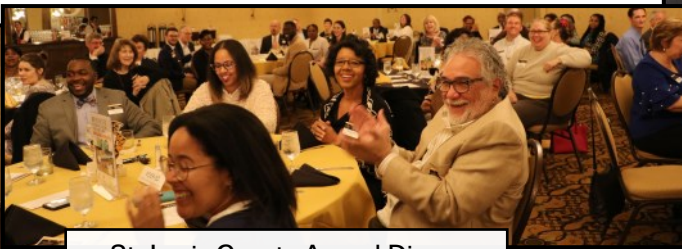
St. Louis County Annual Dinner