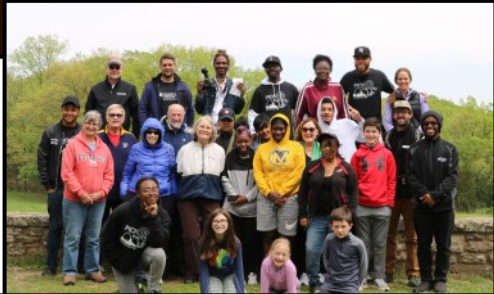
St. Louis Storytelling Festival @ Shaw N.R.