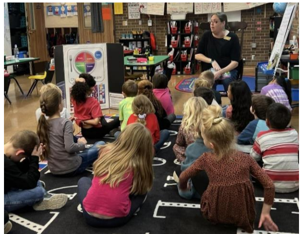
Spainhower Elementary School Fun with Food and Fitness First Grade Class

261 participants were from Saline County