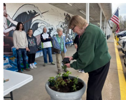
Hands-on learning with container gardening

Master Gardeners (78 members from Cape Girardeau, Bollinger, Scott and Perry Counties) completed 2,596 hours valued at $90,000 given to local communities through beautification, education, and service to others. Twenty-two gardeners complete Master Gardener Core training in 2025.