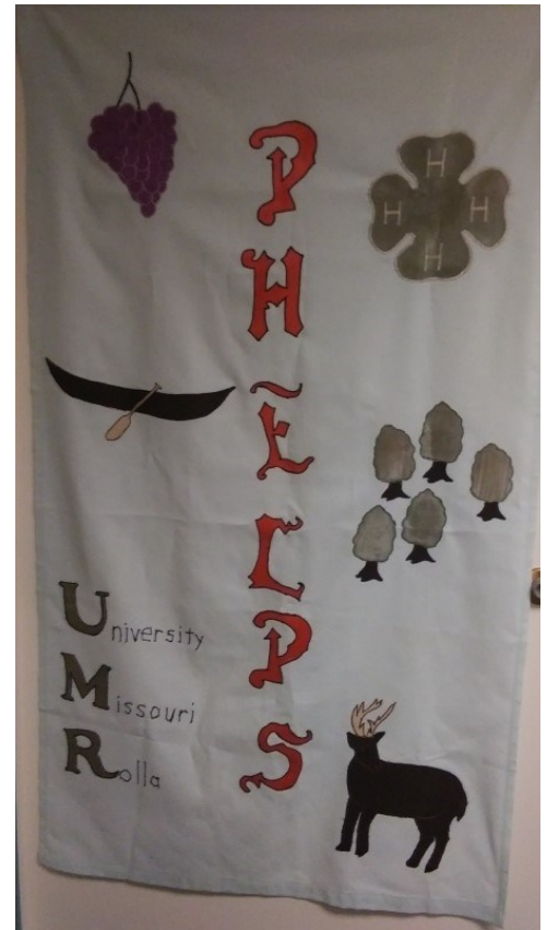
An old banner that now hangs in the Phelps County 4-H office.