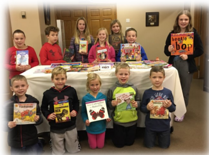
Service Project—Book Collection for children undergoing treatment in Columbia for cancer.