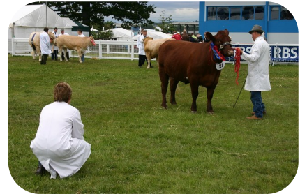
4-H Livestock Judging Clinic