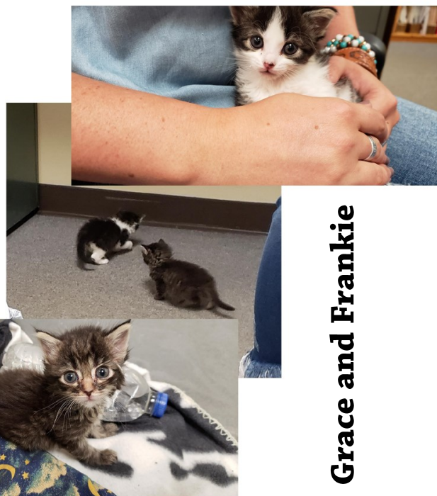
Grace and Frankie

can figure is that they are about 4-5 weeks old. They are starting to eat semi-solid foods and will be ready in about 2 weeks. June 12, 2020. They have quite the personalities and we hope that they can find a home as a pair.