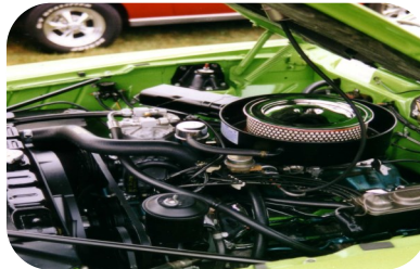
CRANK IT UP

Please remember to finish your projects on your own or in groups of less than 10 (including leader, parents, youth and visitors).