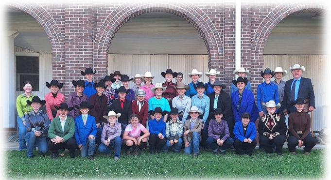
2025 Pettis County 4-H/FFA Horse Show