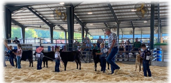
2025 PeeWee Beef Show

Activities kicked off on Sunday with the Poultry and Rabbit shows, then started early Monday morning with livestock check-in, shows throughout the day.