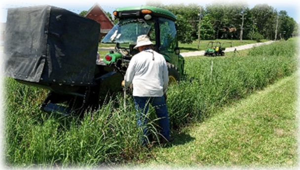
PaddockTrack sensor calibration harvest on Native warm season grass plots at UCM-Warrensburg

Regional specialists continued working with MU faculty to harvest native warm season grass (NWSG) plots with the goal to develop PaddockTrac forage yield estimates for native warm season grass species. PaddockTrac is an integrated electronic forage measurement and yield estimation system. Forage height readings are correlated with clipped sample weights to develop equations to calculate yield estimates. Samples were collected from four NWSG plots at University of Central Missouri in Warrensburg. These data support continuing work at MU