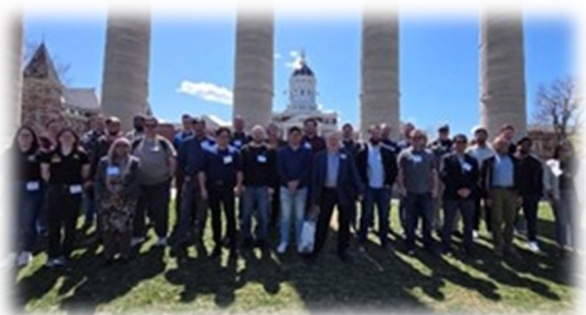
group photo from Microelectronic training