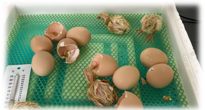
Hatching chicks in an incubator

Pettis County 4-H kicked off three Embryology sessions from February to April. In total, the Embryology program reached 10 schools, 41 classrooms, and involved 854 Pettis County students from Pre-K to 4th grade.