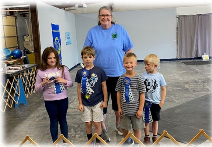
Pettis County 4-H Dog Project Youth – Clover Kids

We had seven 4-Hers show, four Clover Kids participate and one other 4-Her volunteer to help (she didn't think her dog was ready yet). All were members of our Pettis County Dog Project although we had four counties represented!