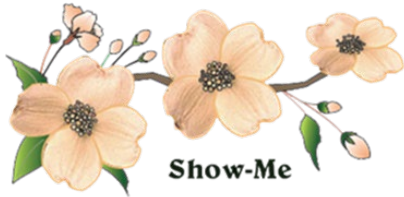
Master Gardeners of Pettis County

We manned a question & answer booth during the Ag-Expo in February. We held 12 classes during the Expo on the following subjects; Planting Trees, Pruning, Blueberries, Bog Gardening and Butterflies. The classes were provided by four Master Gardeners.