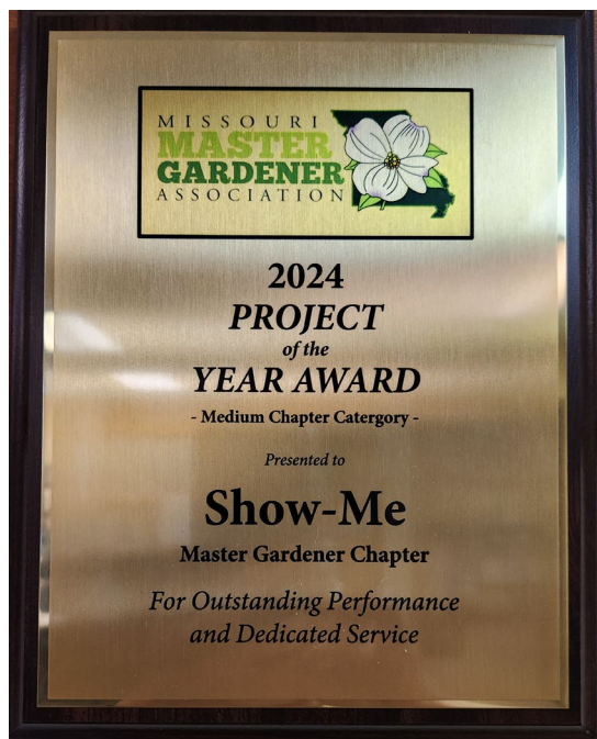
Plaque for the 2024 Project of the Year

Little Sprouts is held on the fourth Friday of the Month. In 2025 we provided programming to 323 Pettis County youth at the Sedalia Area Farmers Market.