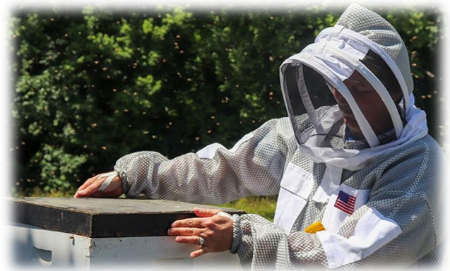
Beekeeper at the hive

Heroes to Hives is a statewide program offered through Michigan Food and Farming Systems (MIFFS) and University of Missouri Extension that seeks to address financial and personal wellness of veterans through professional training and community development centered around beekeeping. It features online training through MIFFS coupled with hands-on training from University of Missouri Extension at our teaching apiaries in Warrensburg, Mt. Vernon, Poplar Bluff and St. Louis. More than 1500 veterans from across Missouri have participated in the program with numerous participants coming from Pettis County.