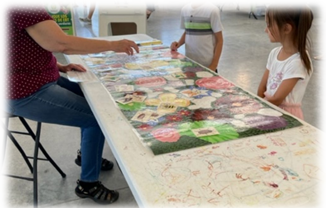
A person and kids at a table learning about pollination

Most enjoyable was the Bee observation hive that was provided by one of our local Beekeepers. The kids even learned how honey is extracted.