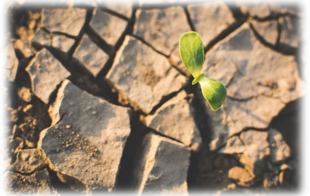
Image of a plant in the ground

"I have learned so many things from Pearls that I will have to really think about what has helped me the most. I have learned something from everything I've been to, from chainsaws to welding to locker plants, chicken operations, and pig breeders. And especially from the hands-on classes you provide. I can honestly say I've never been bored or didn't learn an essential skill from every session I've attended."