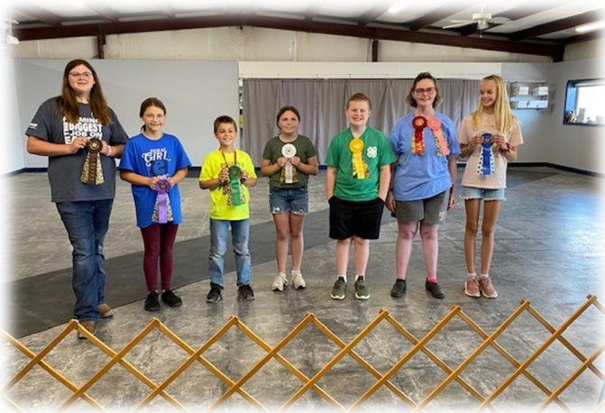
Pettis County 4-H Dog Project Youth