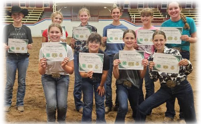
2025 Pettis County 4-H/FFA Horse Show Award Winners

We had seven 4-Hers show, four Clover Kids participate and one other 4-Her volunteer to help (she didn't think her dog was ready yet). All were members of our Pettis County Dog Project although we had four counties represented!