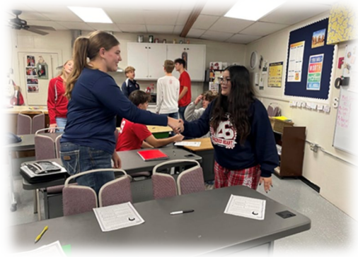
Students practicing a hand-shake