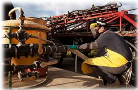
Person at agricultural sprayer tank

Private Pesticide Applicator Training teaches producers how to safely store, handle, and use restricted-use pesticides in agricultural production. Proper application of pesticides results in greater safety for both the applicator and their neighbors. Proper application of pesticides results in reduced exposure of pesticides to the environment, ultimately leading to safer living conditions for all Missourians. Approximately 26 Pettis County residents received a license in 2025. There are currently 208 active private pesticide applicators in Pettis County.