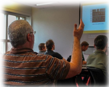
Photo from training course

Engaged with 263 individuals from across Missouri.