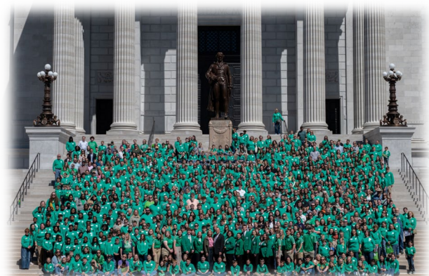
Missouri 4-Hers pose at Capitol

On March 26, 2025, ten Pettis County 4-H members and their chaperones met at the AmTrak Station in Sedalia. For many it was their very first train ride. Nearly 900 4-H members spent the day visiting the State Capitol, the Senators and Representatives of Missouri.