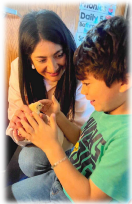
Hatched chick at Parkview Elementary