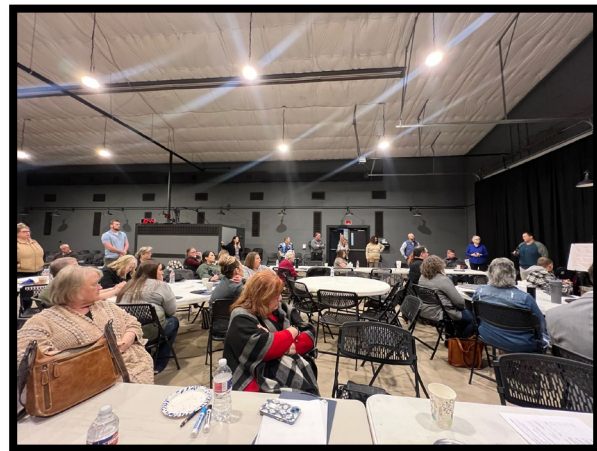
← The SIM Mapping Project for MO’s Judicial Circuit on 3-1-24