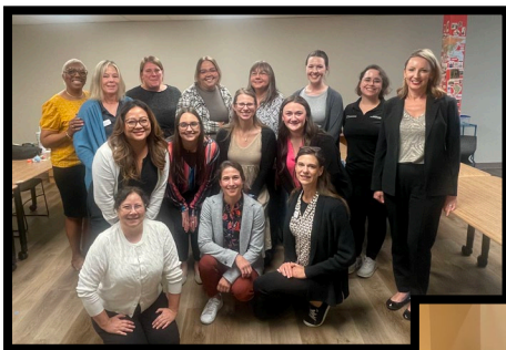
← The CHEO team at MU Extension & Engagement Week (EEW) in October