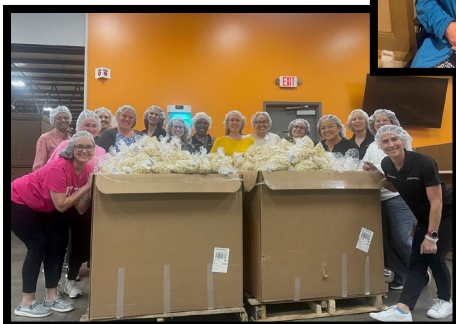
← The CHEO team volunteering at a food bank in Columbia in April