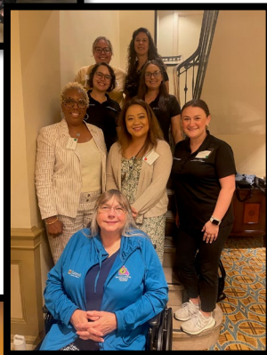
The CHEO team at the National Health Outreach & Engagement Conference (NHOC) in Greenville, SC in May 2024 →