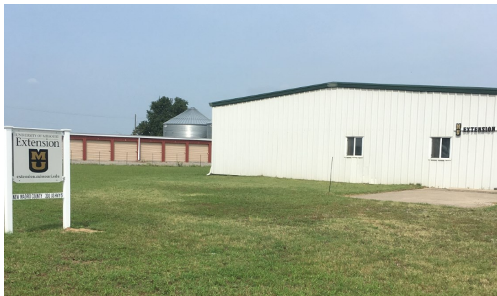
The new MU Extension Office —New Madrid County Missouri. The new office opened in July, 2019.