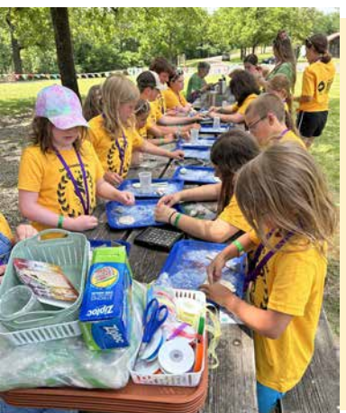
Top: 4-H Council & Staff recognizing local leaders and award winners at the 2024 Recognition Event. Left: Camp Crowder campers learning about clay are at 4-H camp.